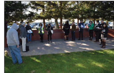
Site for the Steven Taylor Sanctity of Life memorial, as a City Council committee met there in March.

Kearns & West plans to propose a final design to the City Council in the fall.