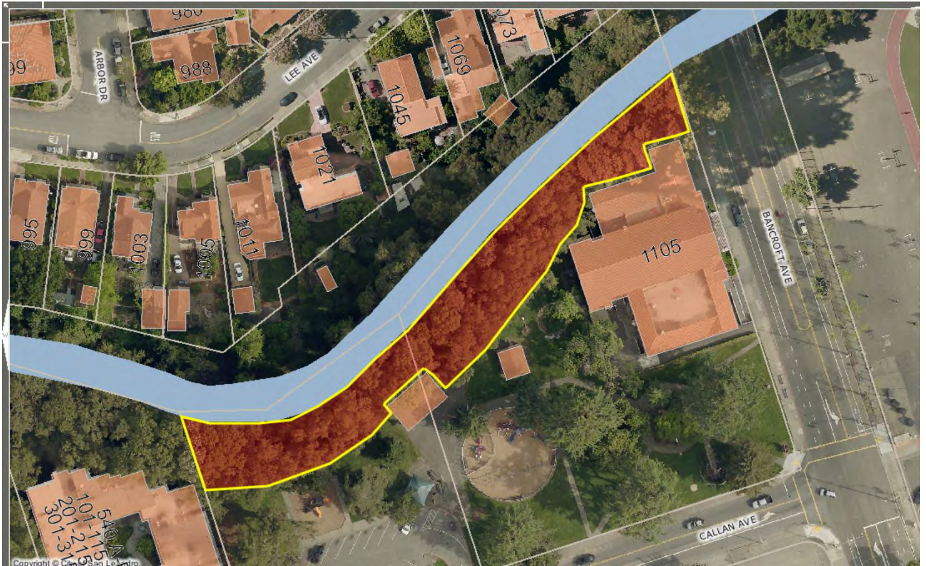
Row of mature eucalyptus trees to be topped (at either a height of 50' or 30' above grade). Building shown as 1105 Bancroft is owned by Alameda County. Access on the north side of the building is gated. Contractor will be given access.