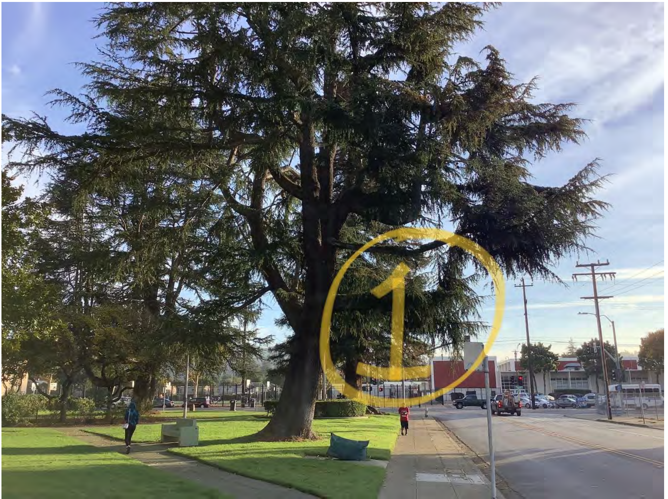
Tree to be trimmed.