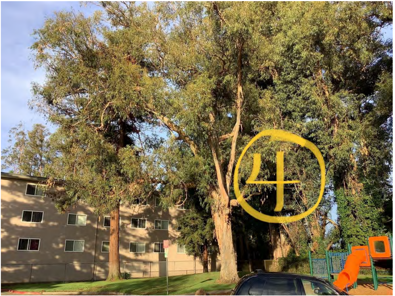
Tree to be removed/stump ground out.