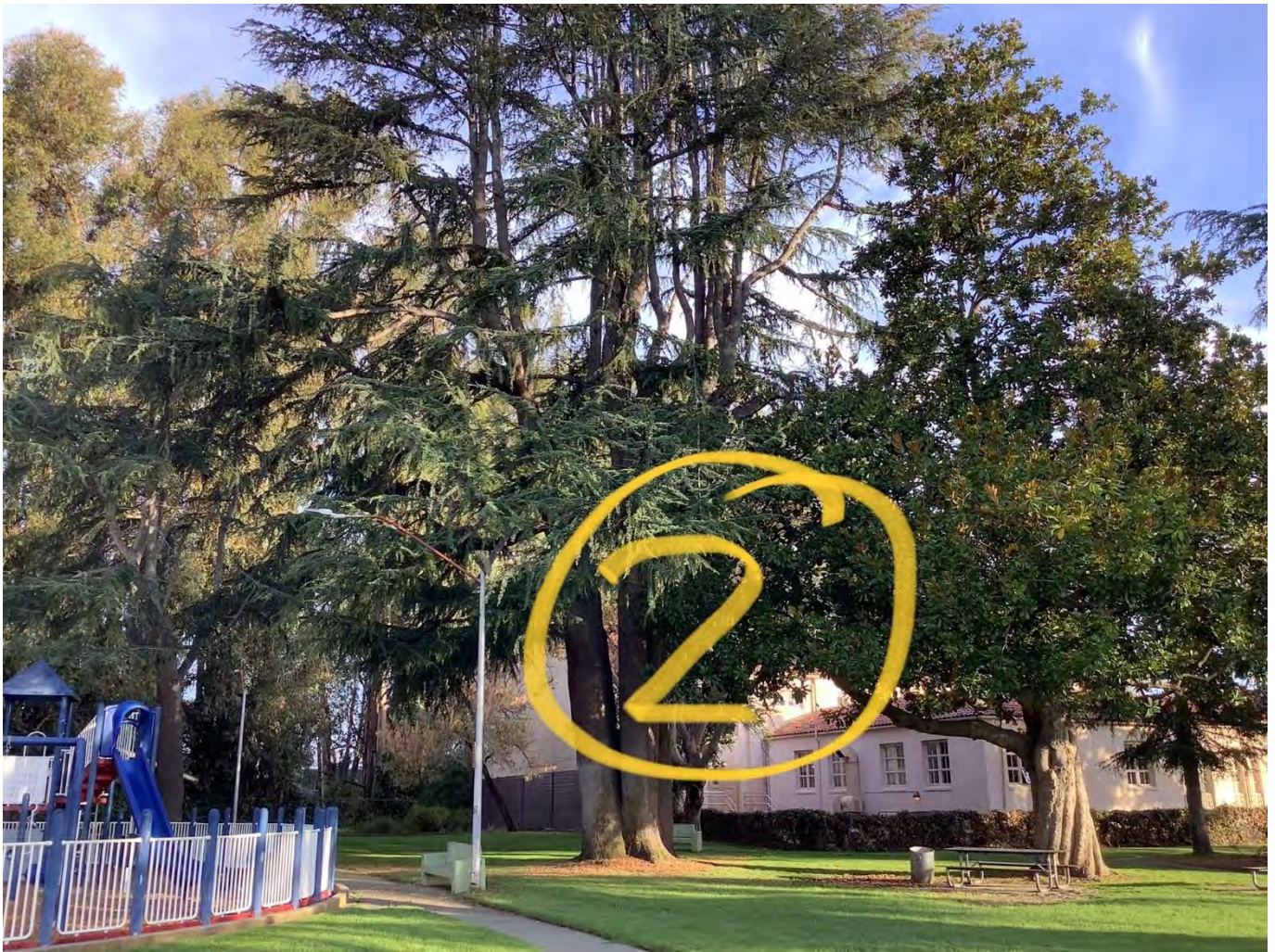
Tree to be trimmed.