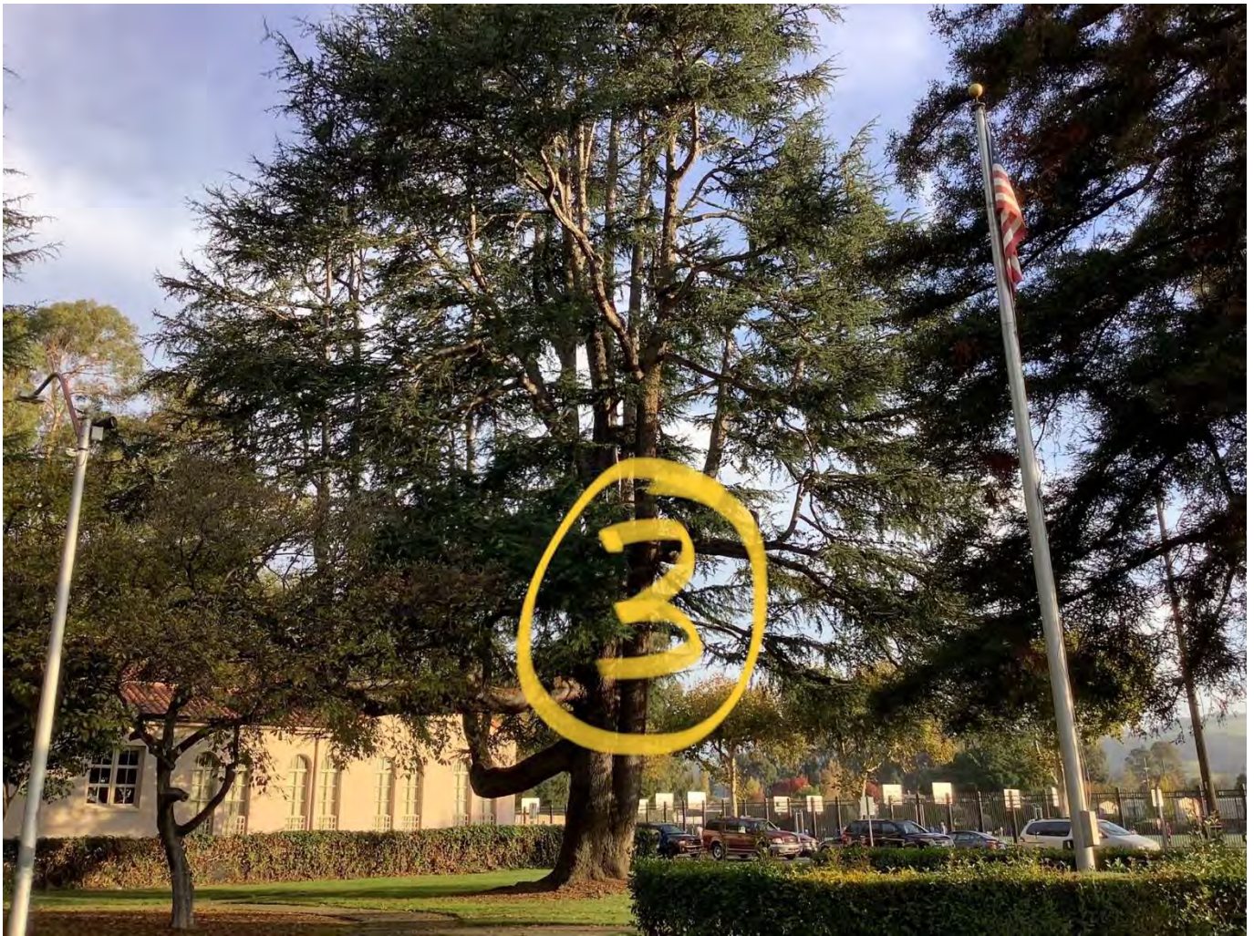
Tree to be trimmed.