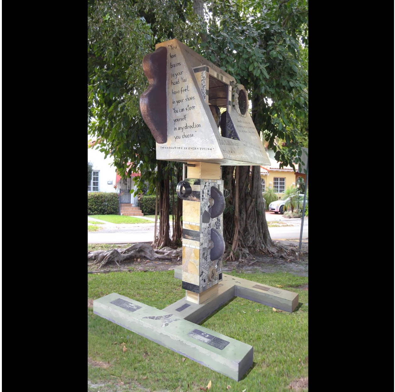
"INDIVIDUALITY n,2" 9.5'x 6'x 6' Mixed media 2020