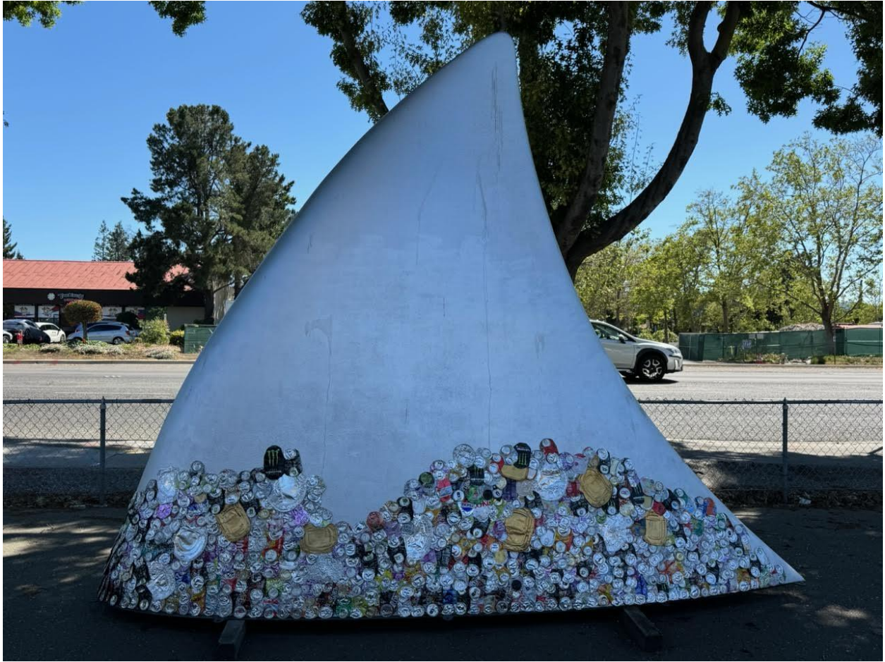
"Unsafe to Swim" 11.5' H Reclaimed aluminum cans and trays