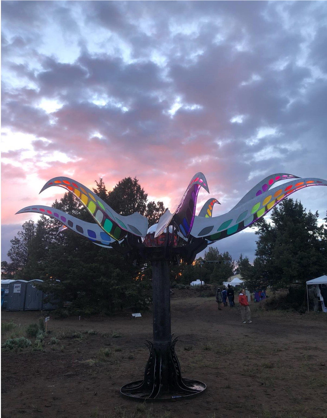
"Flour de Lux" 11' to 17' x 20" D Steel, electronics, lights