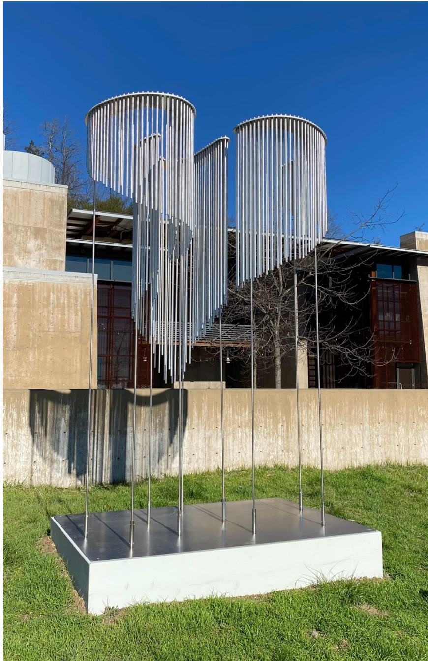
"Triad: Aurora, 2022" Stainless Steel, Aluminum 10' x 75" W x 52"D