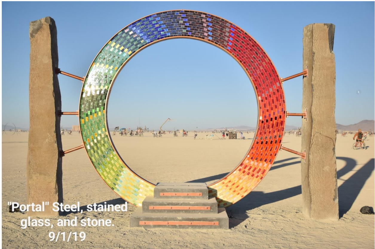
"Portal" Steel, stained glass, and stone. 9/1/19

"Portal" 12' x 9' x 3' Steel, stained glass, stone