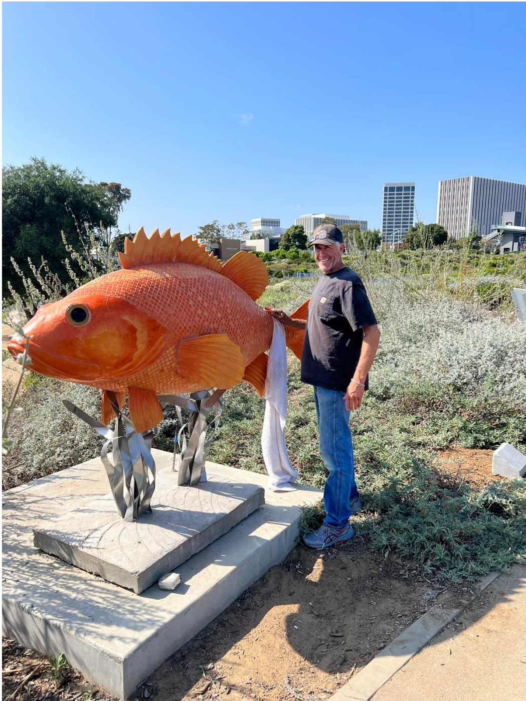
"Tulip the Rock Fish" 5' x 10' x 3' Mosaic tile, concrete 2016