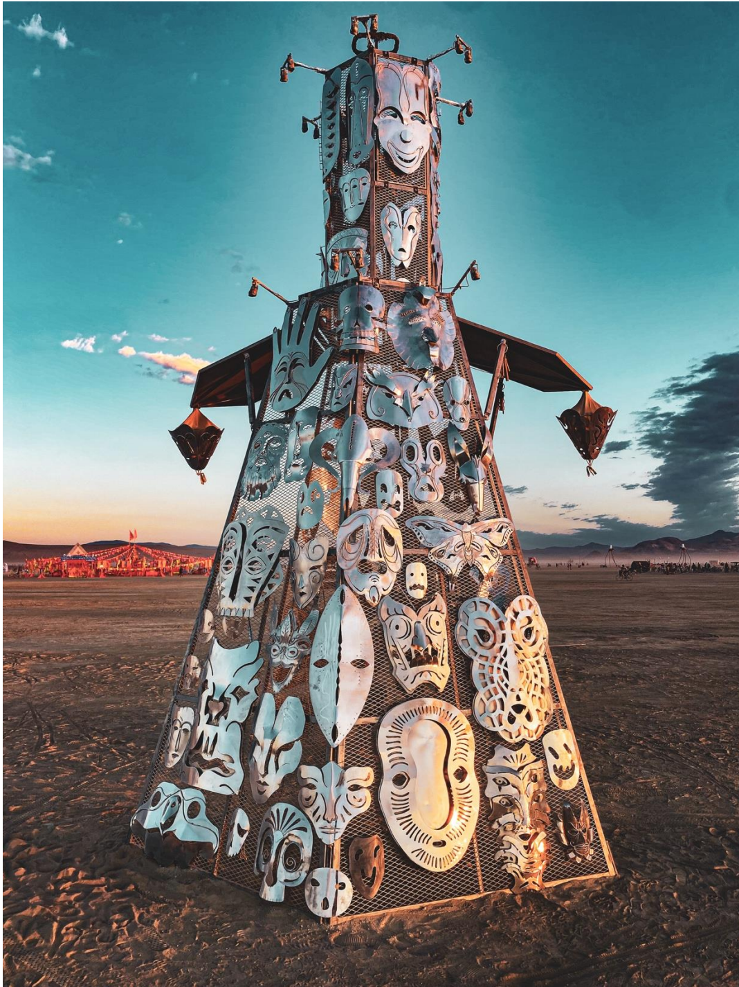
“Temple of Masks” 21’ H Steel, Chromes Steel