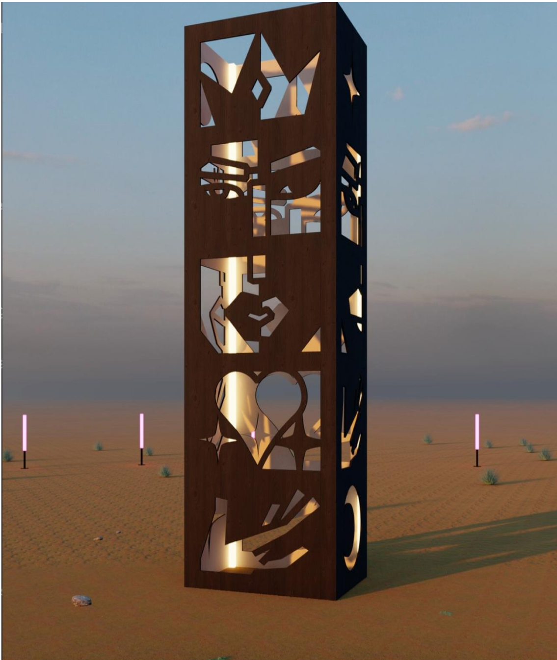
"THEM" 24' x 7' x 10" Wood on steel scaffolding