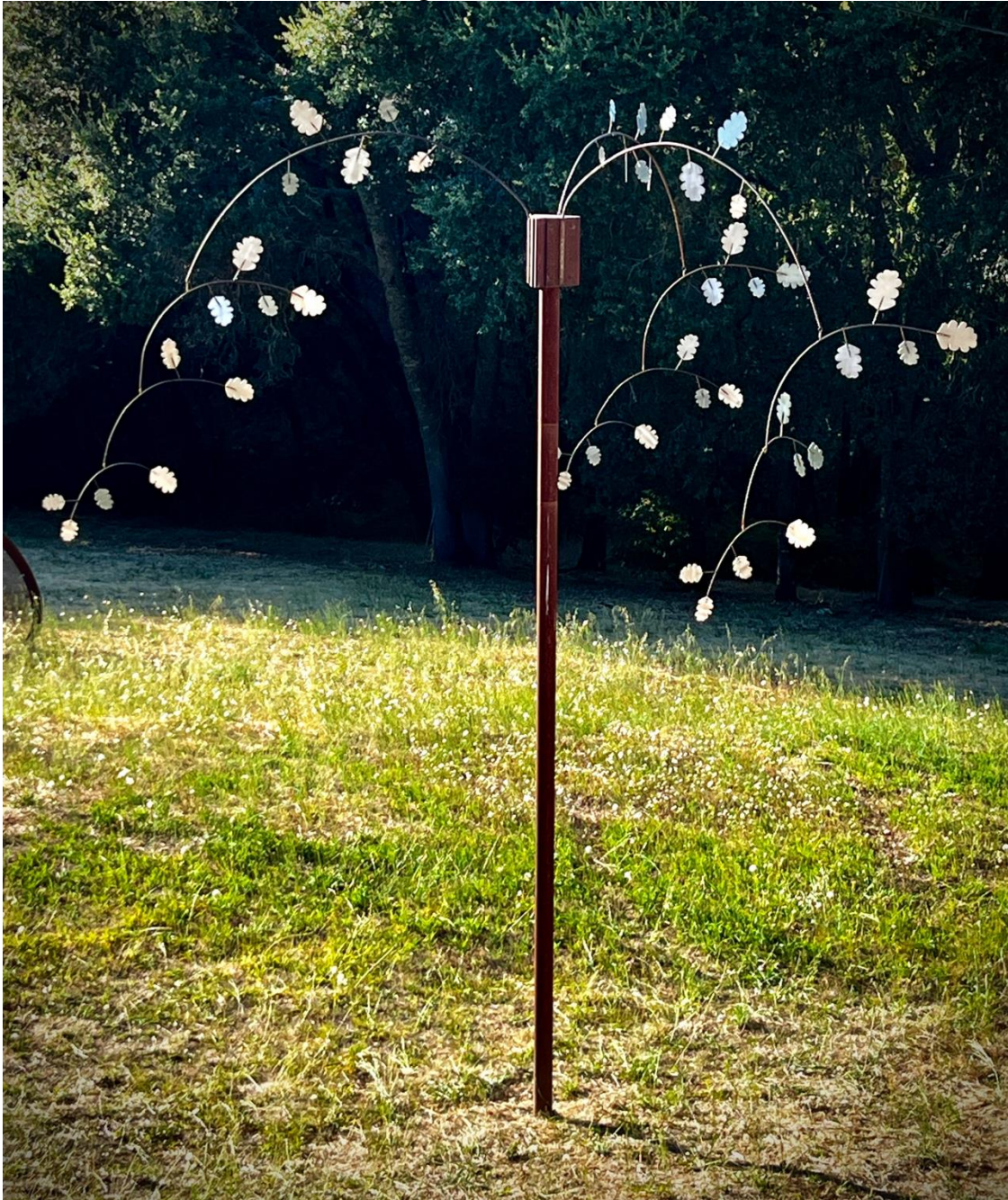
"Quercus Surrogate, 2024" Steel, Oak, Aluminum, Stainless 186"H x 144" W x 144"D