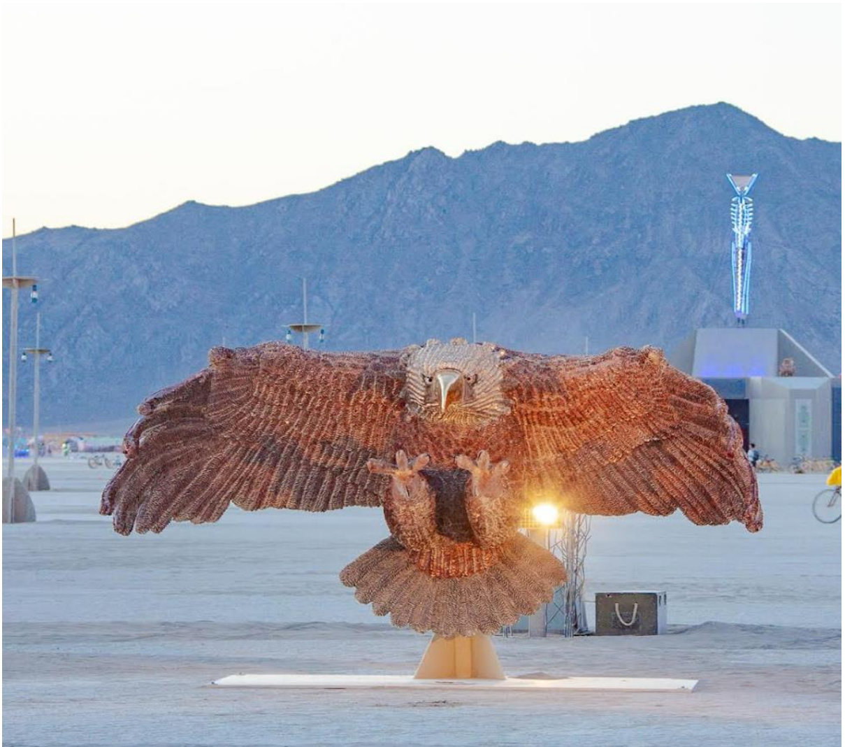
"Prey" 7'x 12' x 4'