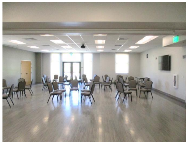
San Ramon Amador Rancho Community Center