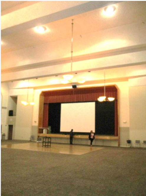
Marina Community Center

City of San Leandro City Council Facilities Committee April 19, 2016