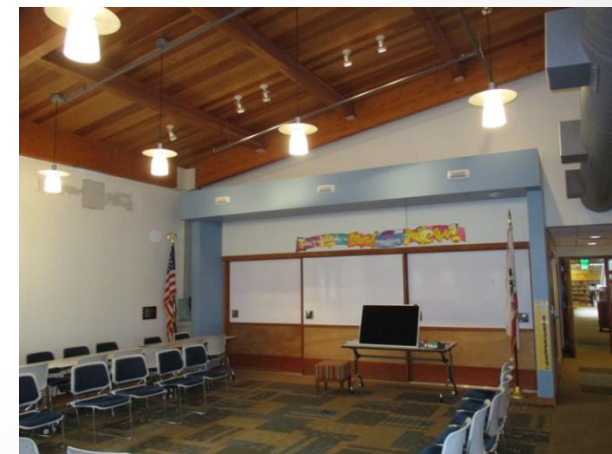
Marina Branch Library