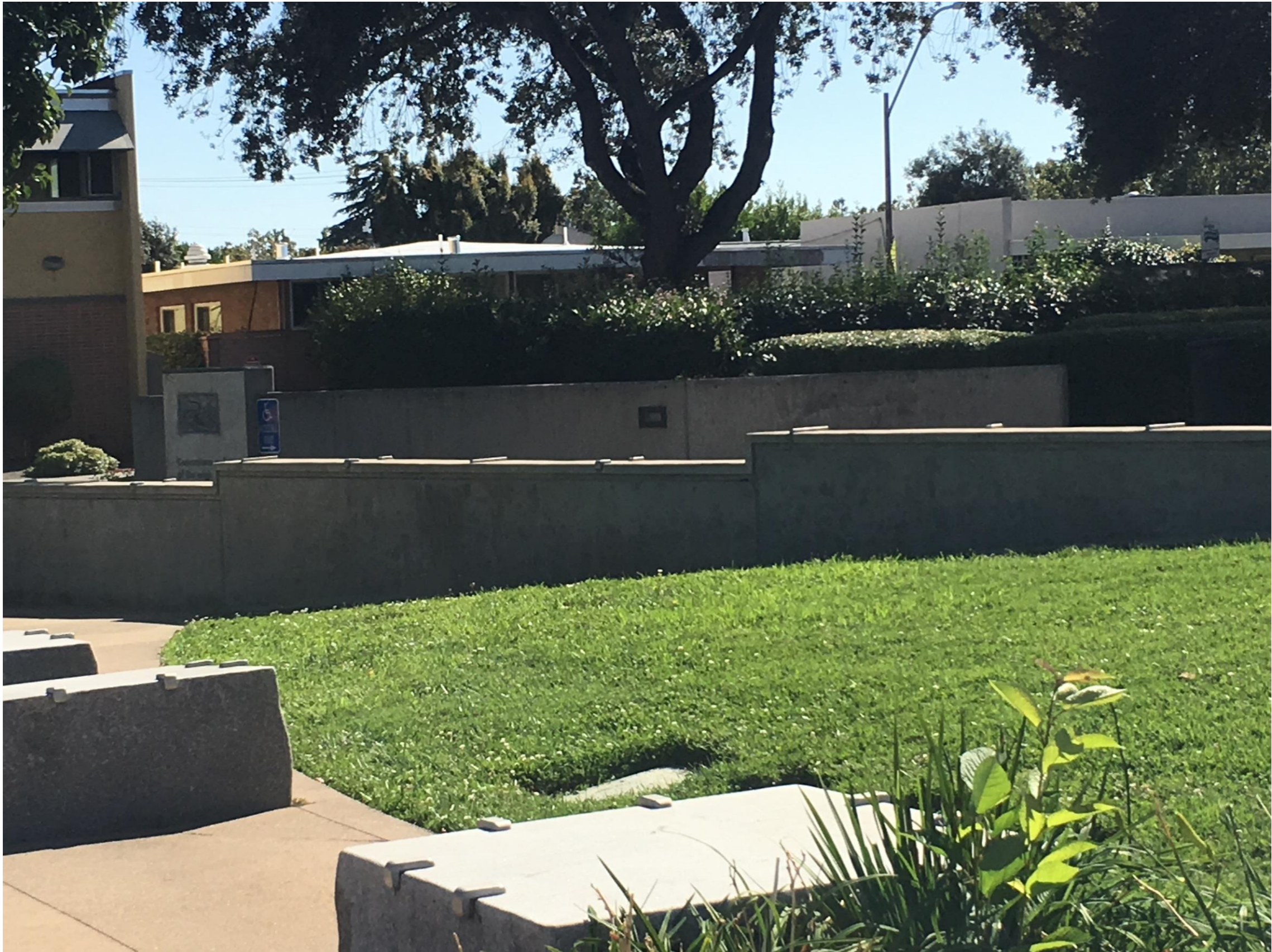
Poetry along the retaining wall can be a lead in to the library and sculpture