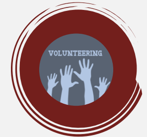
Volunteers Coming Soon/TBD

City to start negotiations with DST in order to enter into contract for services. Council previously approved $800K in ARPA (over 2 FYs).