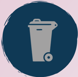
Bulky Pick-ups TBD

Council presentation February 22 on proposed new 'smart' solar cans to be installed in the Downtown. Total of 13 stations to be installed in late March/early April. Funded by $100K grant from Amazon.