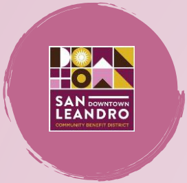
SLIA In process

Council presentation February 22 on proposed new 'smart' solar cans to be installed in the Downtown. Total of 13 stations to be installed in late March/early April. Funded by $100K grant from Amazon.