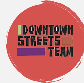
DST Coming Soon

City to explore costs associated with expanding sidewalk cleaning (by contractor) to other areas of the City.