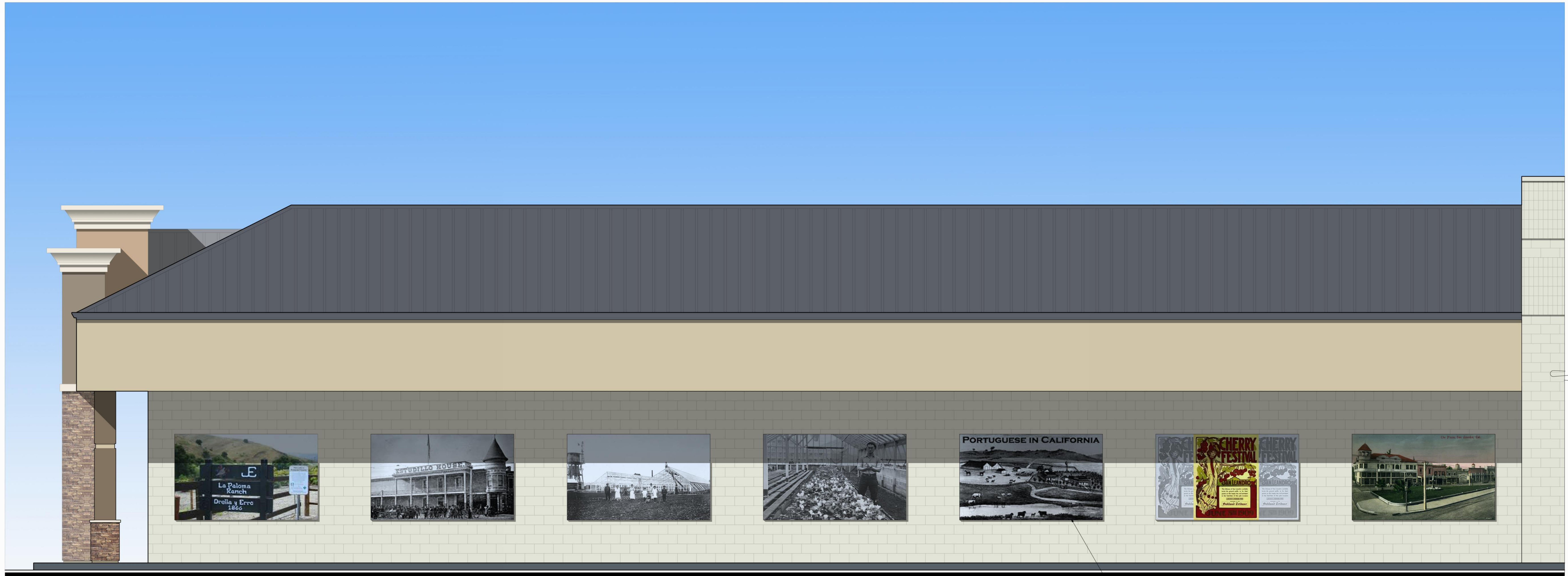
7 - 6' X 10' PICTURE BOXES, EVENLY SPACED