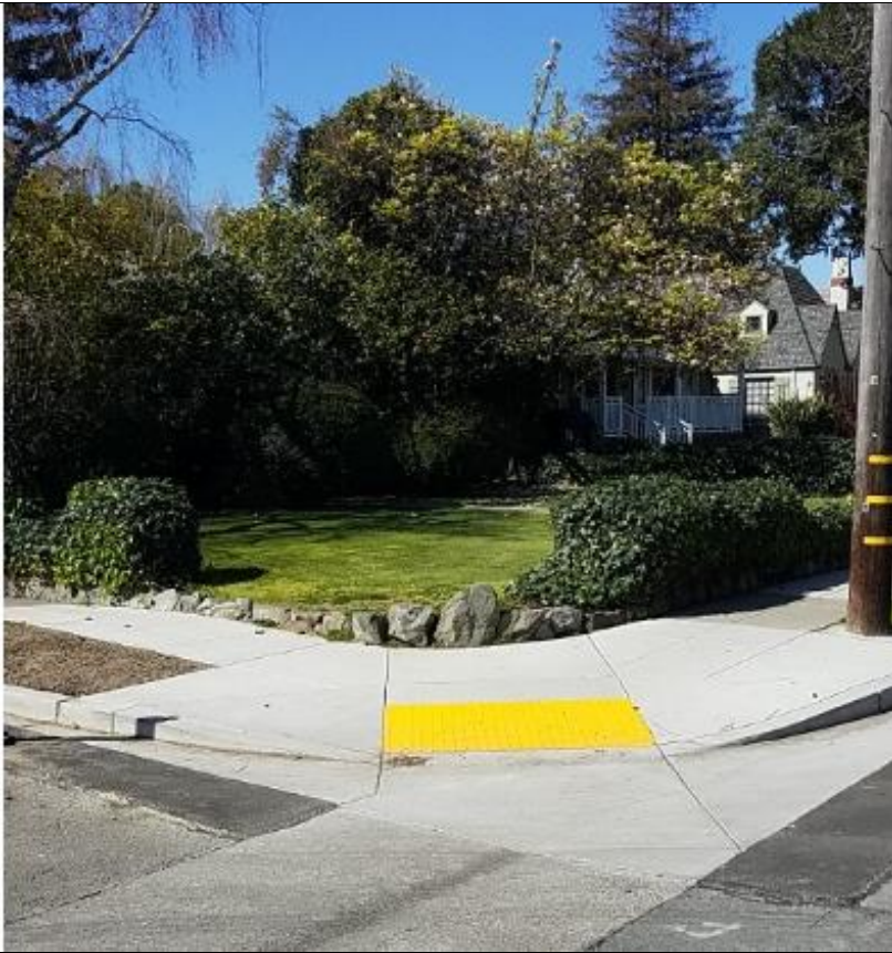
COMPLETED ACCESSIBLE CURB RAMP