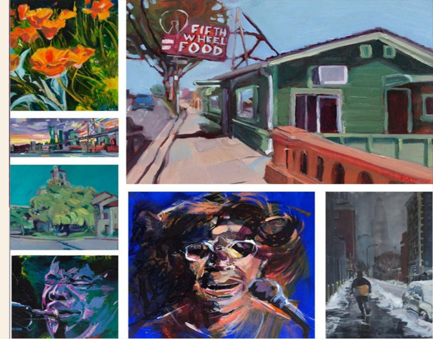
Eric Shea, “San Leandro: Order Up”