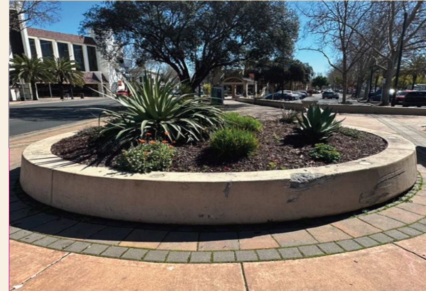
San Leandro Improvement Association, "Bell Planter Mosaic"