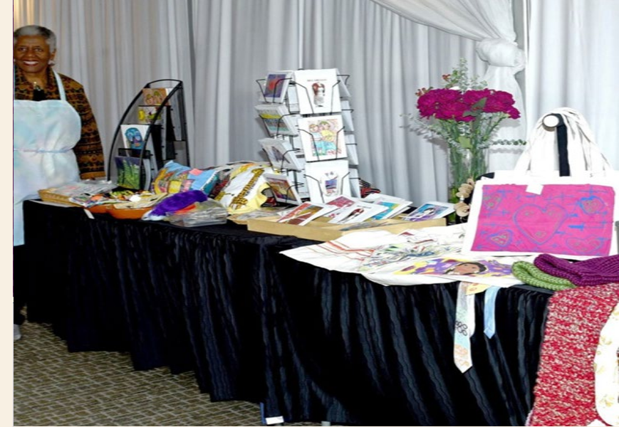
Davis Street, "Disabilities Services Art Program and Show"