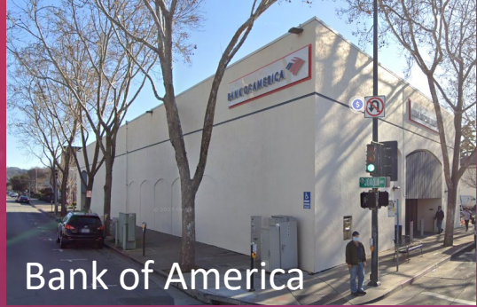
Bank of America