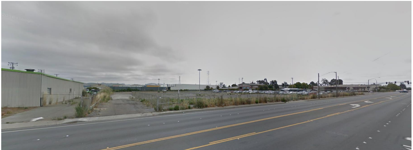
1700 Doolittle Drive (Google 2016)