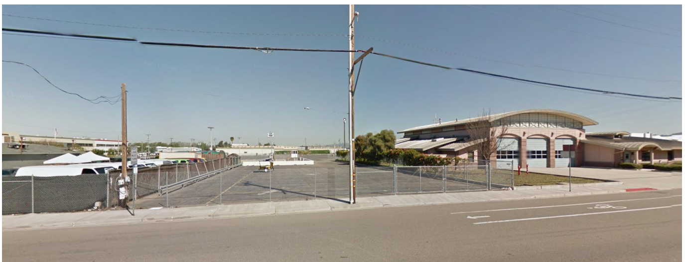
Williams Street Frontage, between adjacent corner property (left) and Fire Station #10 (right)