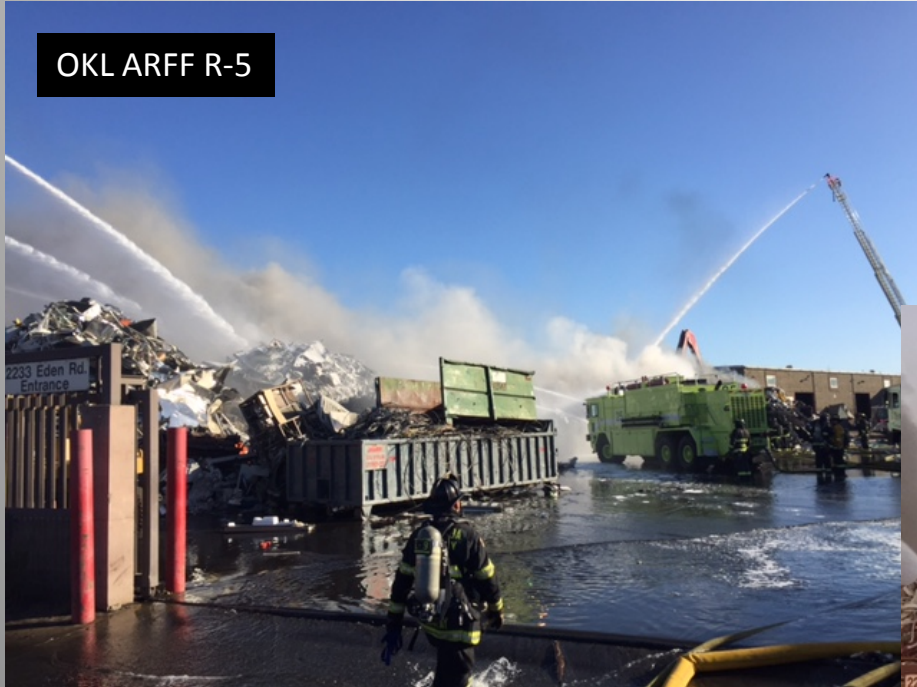
OKL ARFF R-5