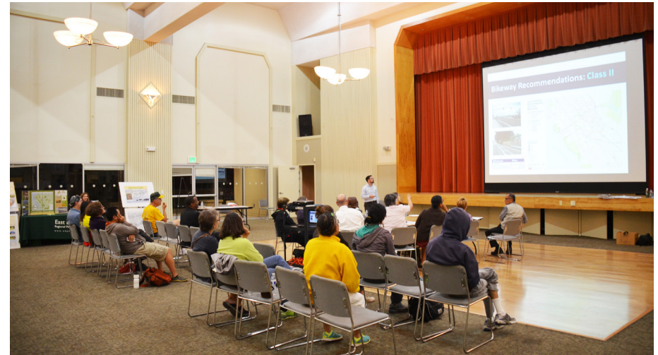
Members of the BPAC and the public discuss recommended projects.