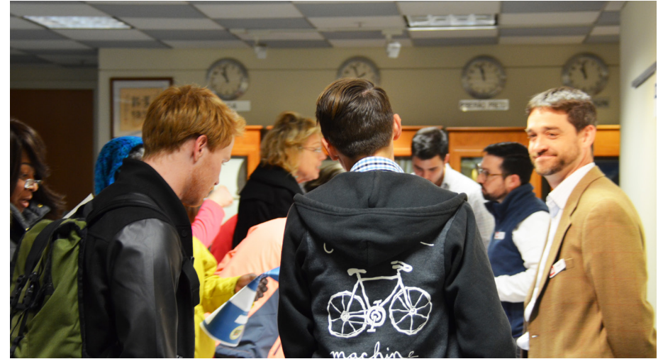
BPAC members and local advocates share their comments with consultant staff during the first Community Open House.

the Police Department should be evaluated every three to six months and tabulated to show patterns by location and collision type.