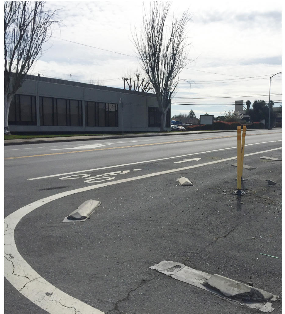
A segment of bike lane near the Kaiser Medical Center area.