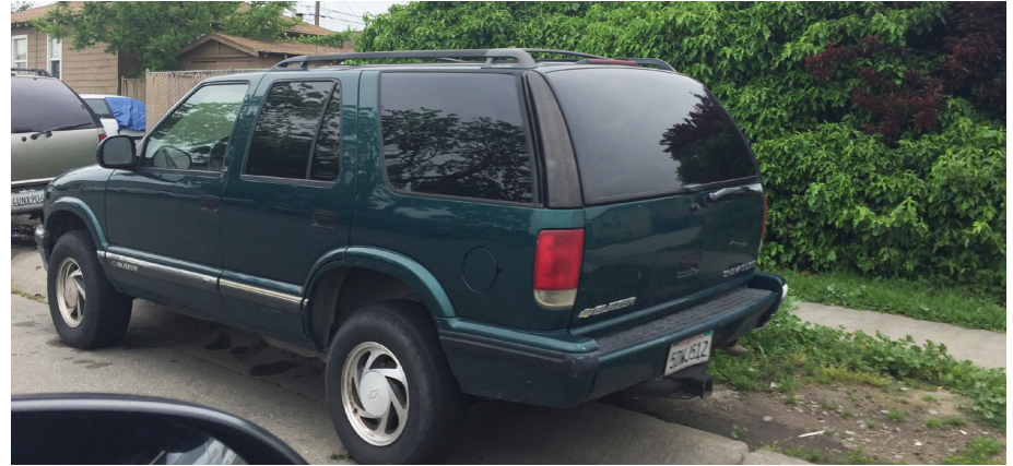
Rolled curbs throughout the city allow for easy encroachment by vehicles.