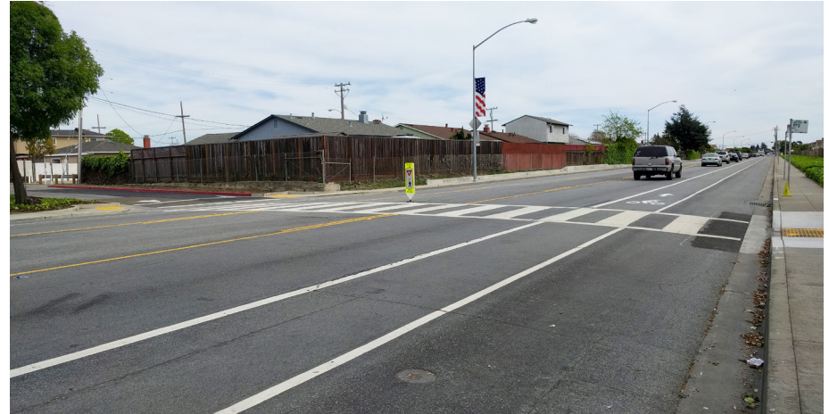
Wicks Boulevard: Existing Class II facilities are recommended to be updated to Class IV facilities.

The projects were grouped into three implementation categories based upon the resultant project scoring. The three categories are defined as follows: