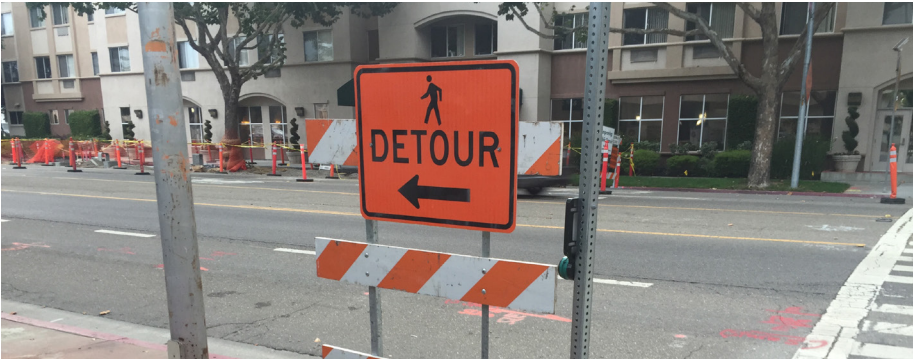
Construction along East 14th Street for East Bay BRT.

Bikeway construction estimates are based on a per-mile rate that includes related construction costs and materials. This includes costs for bike lanes on both sides of the roadway. In lieu of providing numeric estimates for pedestrian recommendations, categorical estimates are provided instead: low cost, moderate cost, and high cost. Given the highly variable and site-specific nature of pedestrian improvements, providing a rough dollar estimate can be misleading as it cannot account for site specific conditions that alter design, materials, and pricing.