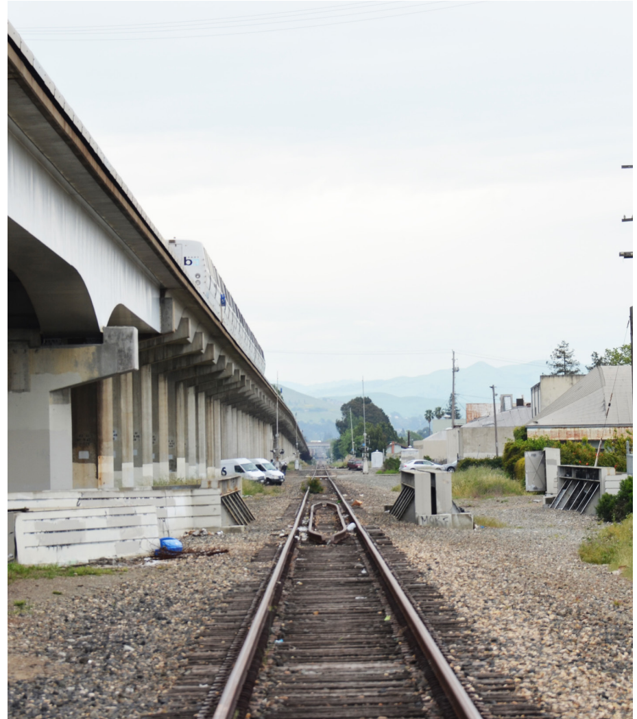
East Bay Greenway is one of the highest rated projects in this plan.

High priority projects are categorized by two funding sources: 1) Committed Measure B and Measure BB Pass-Through Funds and 3) Competitive Grants including the Active Transportation Program (ATP). A detailed description of potential competitive funding sources available to the City can be found in Appendix D.