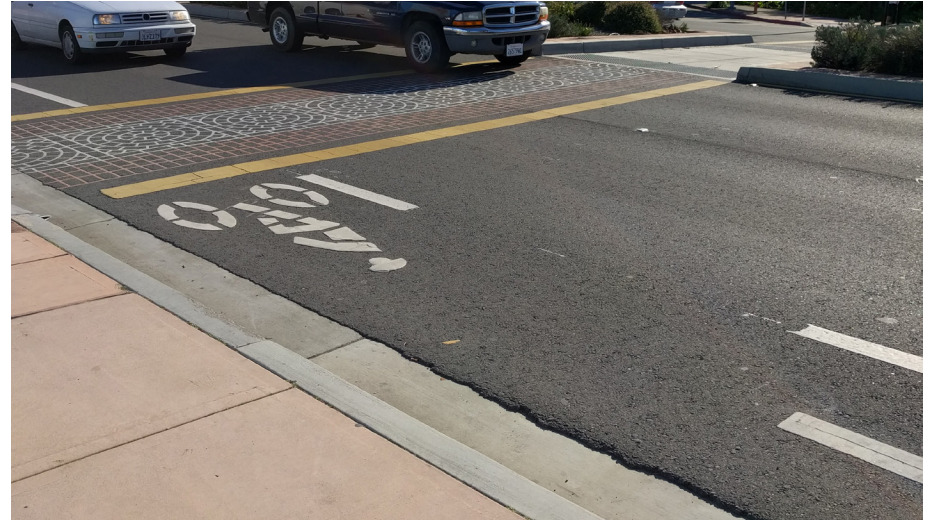
Bicycle and pedestrian facilities along San Leandro Boulevard.