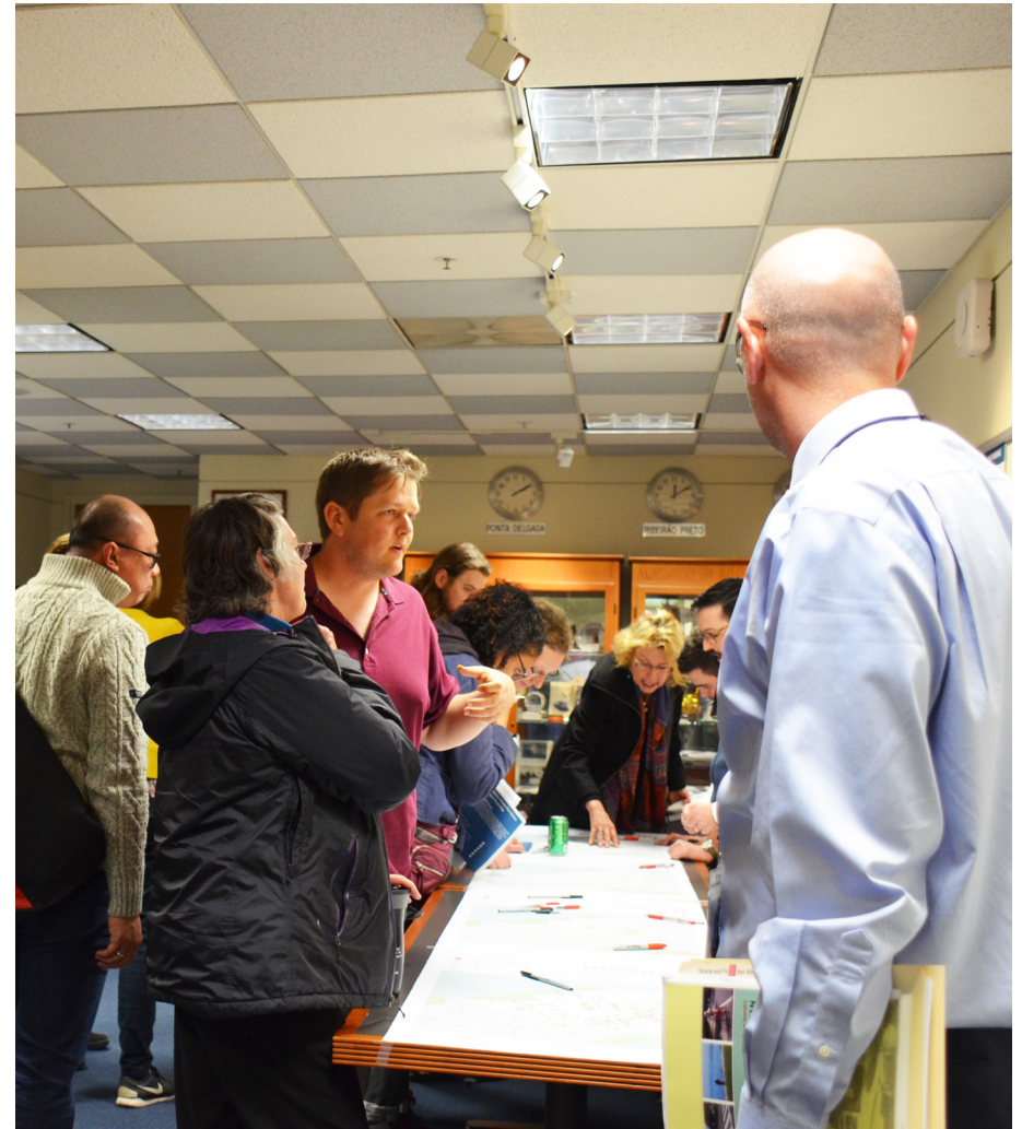
Listening to the public was a critical component of developing the recommendations for this plan.