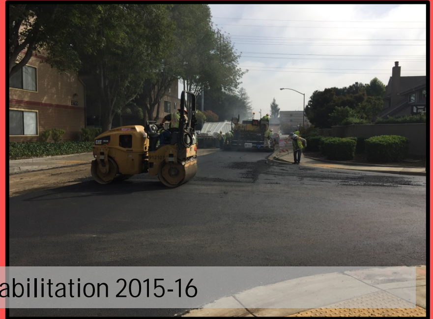
Annual Overlay Rehabilitation 2015-16