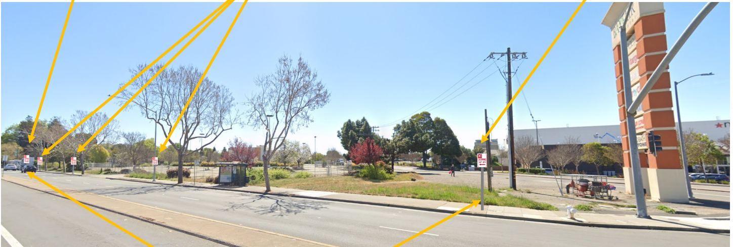
2 (TWO) NEW UNISTRUT POSTS