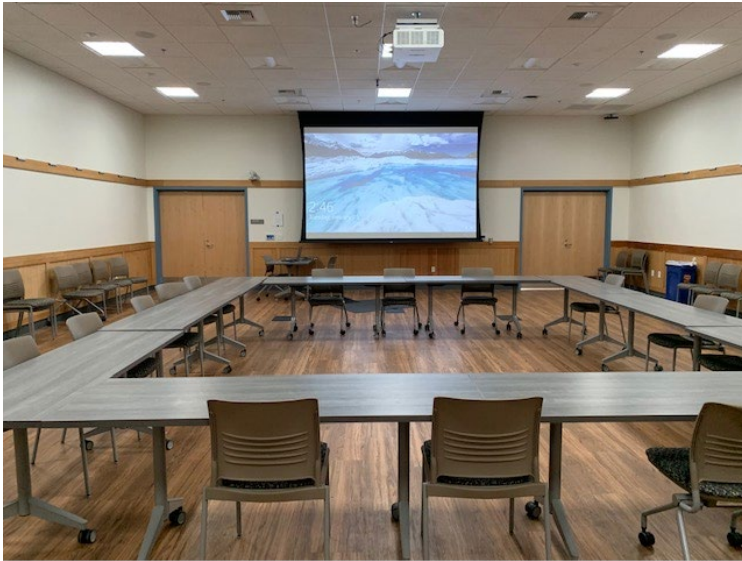
SURLENE GRANT CONFERENCE ROOM