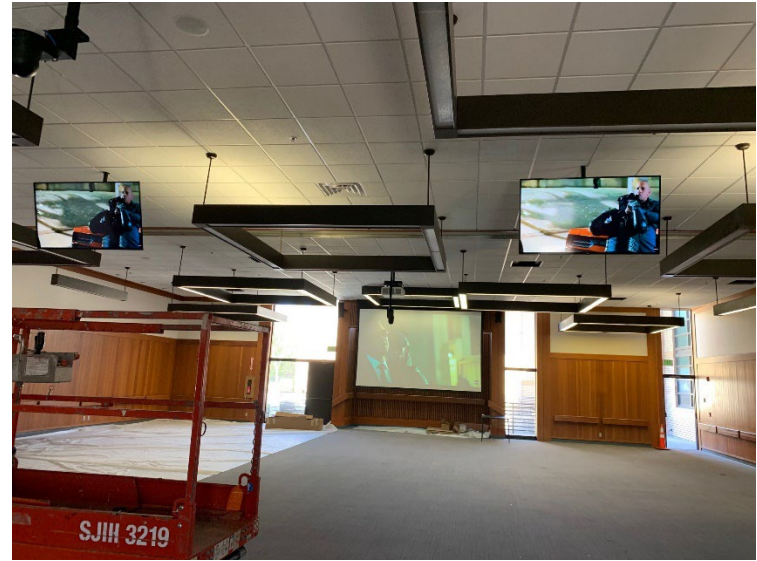
KARP / ESTUDILLO MEETING ROOMS