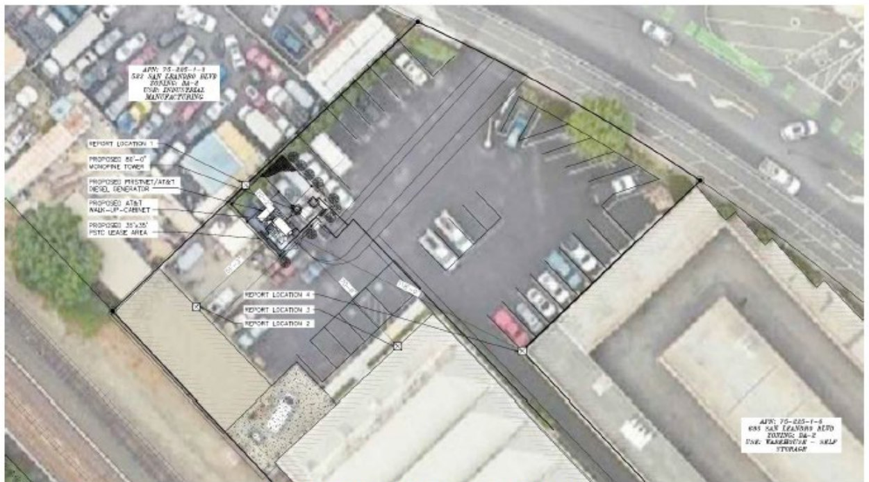
Figure 1: Noise Measurement Location

A noise study was completed on April 30, 2024 by Mark Quakenbush, PE from Tower Engineering Professionals. The report shows four locations that were measured with a noise meter for typical (ambient) noise. The results are recorded below.