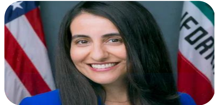
New Senate Leadership