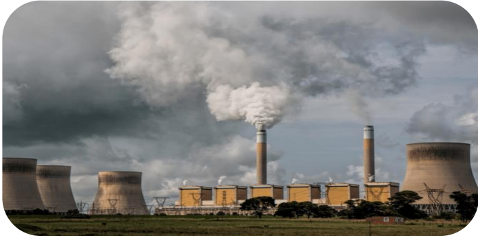
Cap and Invest Reauthorization (AHSC Funding)