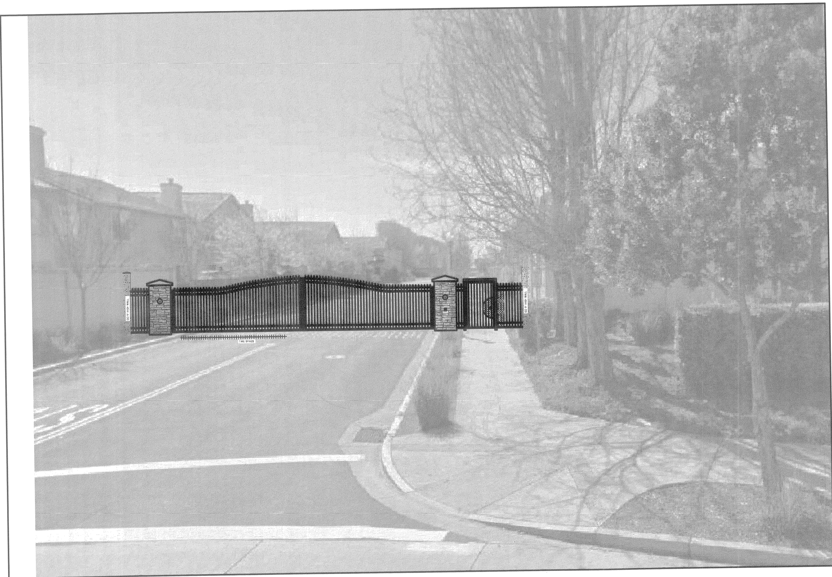
2 RESIDENT'S ENTRANCE GATE - SITE PLAN ELEVATION 1/8" = 1'-0"