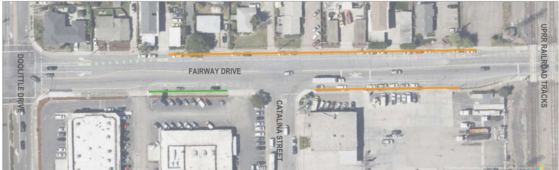
Nighttime Observation on 1/15/2025, 9:00pm