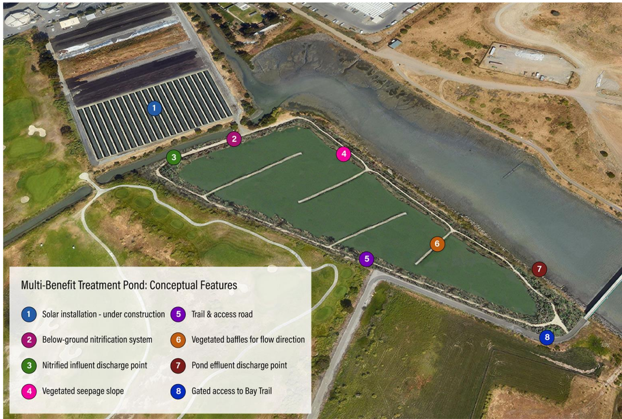
Site plan for the proposed project