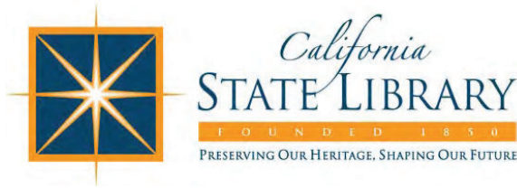
EXHIBIT A: TERMS and CONDITIONS