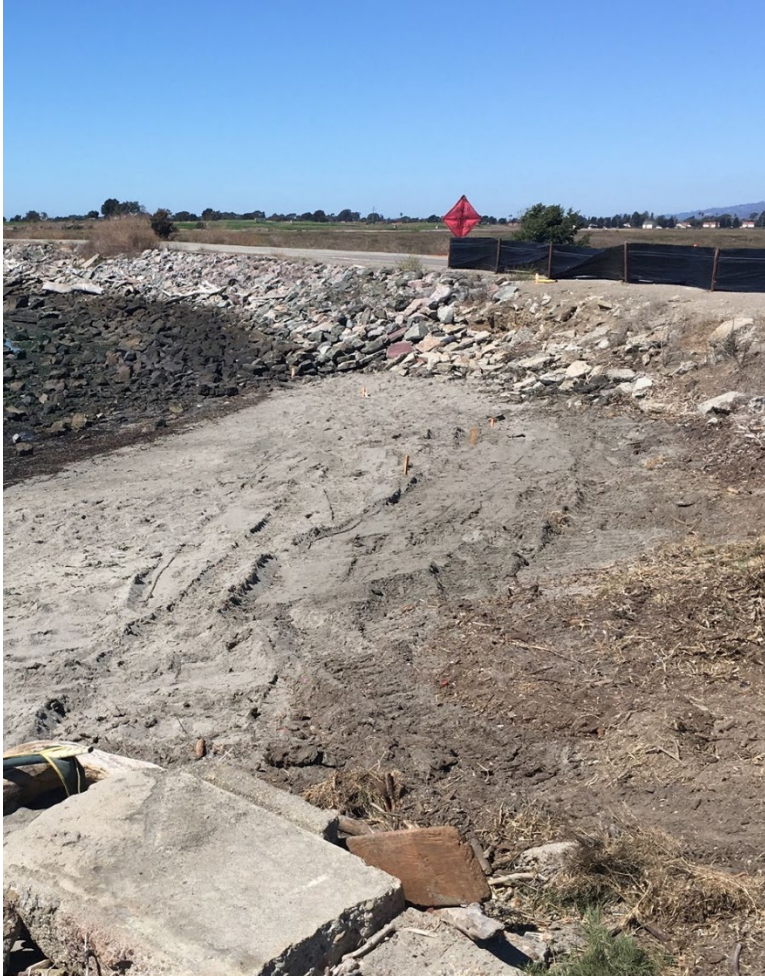
ORIGINAL LEVEE CONDITION