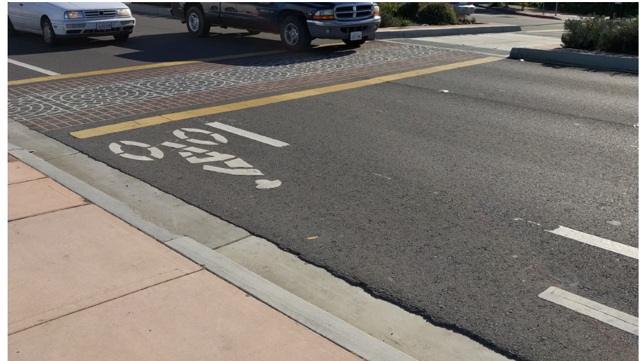
Bicycle and pedestrian facilities along San Leandro Boulevard.