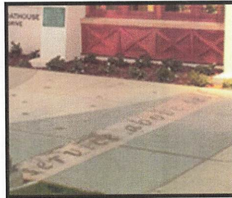
Brass Lettering Inlay at Lake Merritt Boathouse