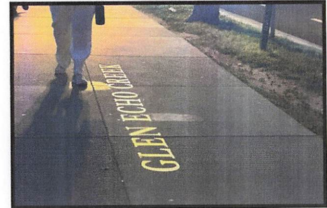
Brass Lettering Inlay at Lake Merritt