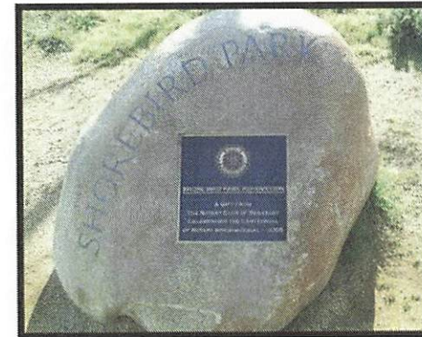
3'-4' Height Boulder & Plaque at Berkeley Shoreline Park

Rotary Club of San Leandro Vision Board - April 2026