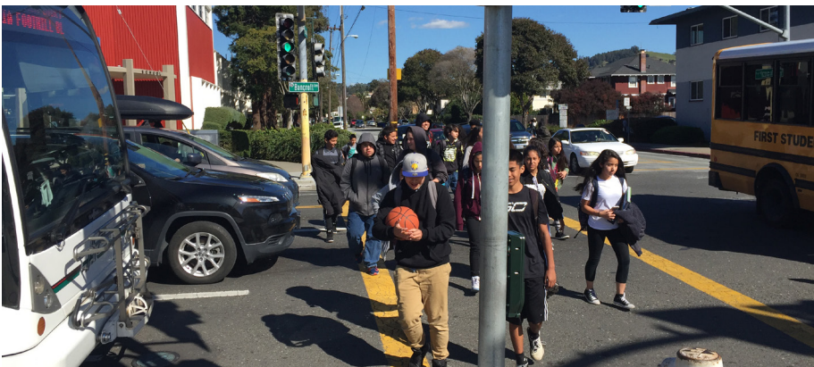
Afternoon dismissal at Bancroft Middle School: students crossing Bancroft Avenue at Estudillo Avenue.

13. Bancroft Middle School: During the school site assessment at Bancroft Middle, it was observed that a high volume of students wish to move from