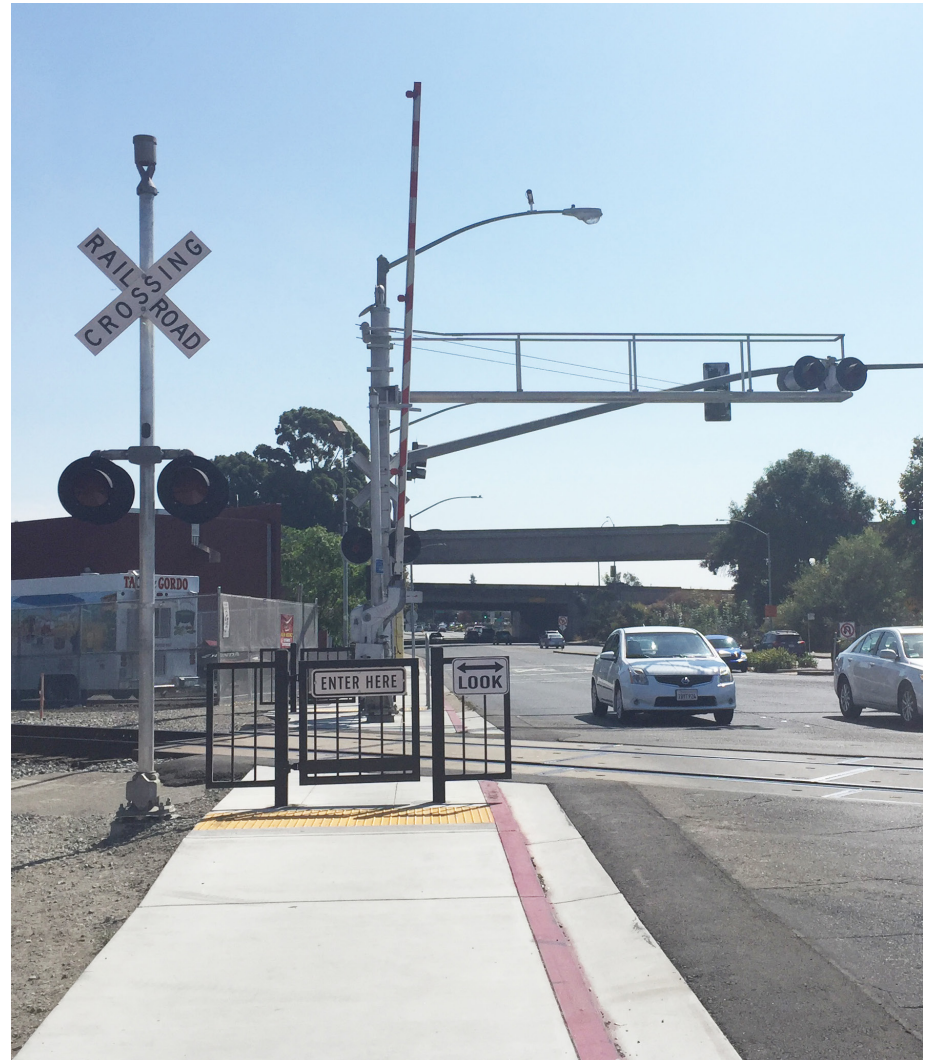
A pedestrian railroad crossing gate on Hesperian Boulevard of the Nilas Subdivision.

12. Hesperian Boulevard Corridor is a key connection from the southeastern part of San Leandro into the Bay Fair Area, providing connections to BART, shopping, and other activity generators. Hesperian Boulevard has a history of a high number of pedestrian collisions, including a fatality. The Bay Fair TOD Plan (under development) includes a proposal for a road diet on Hesperian Boulevard with a bicycle and pedestrian esplanade, that should be strongly considered for implementation.