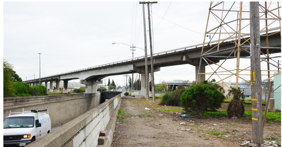
A potential alignment of a pedestrian facility next to the Washington tunnel.

The pedestrian facilities should be improved to create a more comfortable pedestrian environment by adding a buffer between the sidewalk and the adjacent fast moving traffic. This should be coordinated with Caltrans the next time the overcrossing is reconstructed.