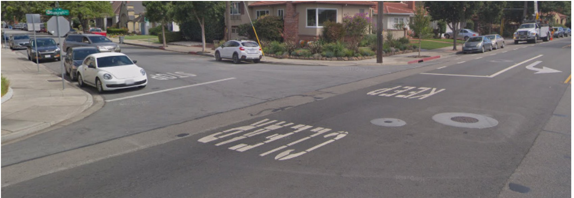
One of the approaches of the Bancroft Avenue/Oakes Drive Intersection, looking eastward towards Oakes across Bancroft Avenue.