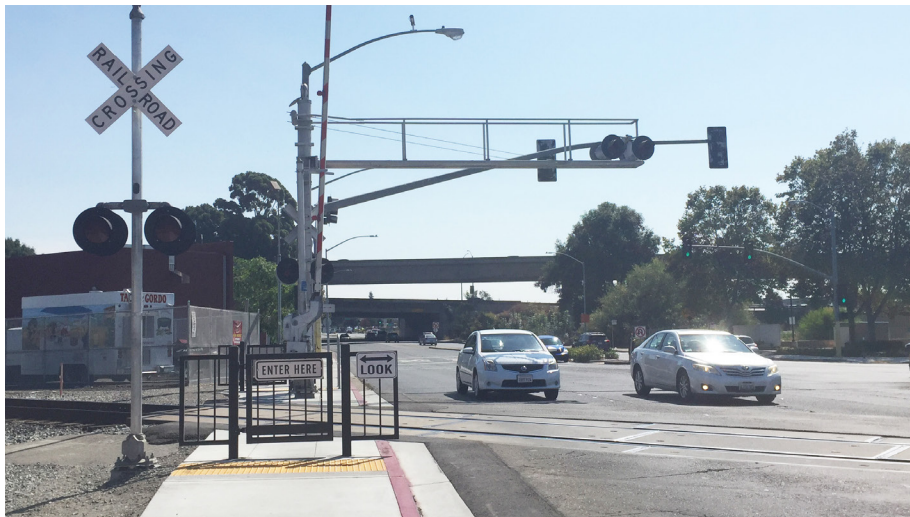
Improved pedestrian crossing features of the Niles Subdivision along Hesperian Boulevard.

24. Alvarado Street/Fremont Avenue: This is an asymmetrical T-intersection with a free right turn lane and two pork chop islands. This intersection currently does not provide a crossing for pedestrians to cross Alvarado Street. In addition to adding a crossing for Alvarado Street, the City should also study removing the free right turn lane, reducing conflict points for pedestrians and improving their safety.