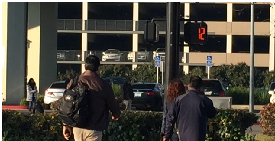
A pedestrian signal head with countdown timer.