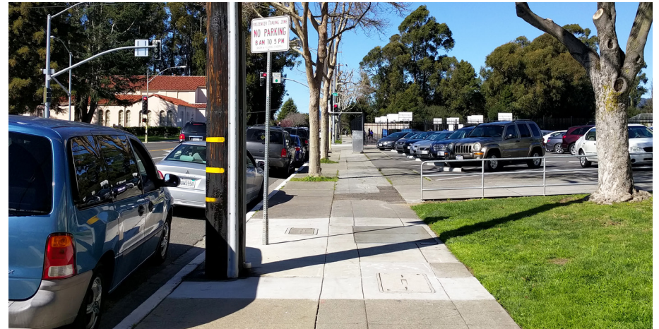
Bancroft Avenue sidewalks in front of Bancroft Middle School.