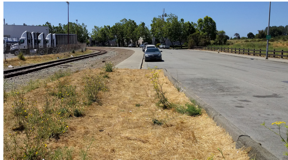
The sidewalk on the north side of Neptune Drive stops short of the Oyster Bay Regional Park entrance.