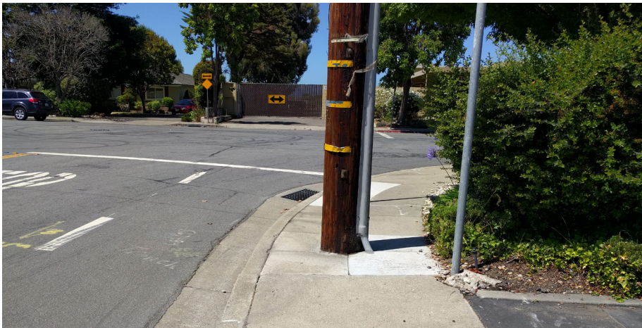
An obstructed sidewalk in the Marina neighborhood.