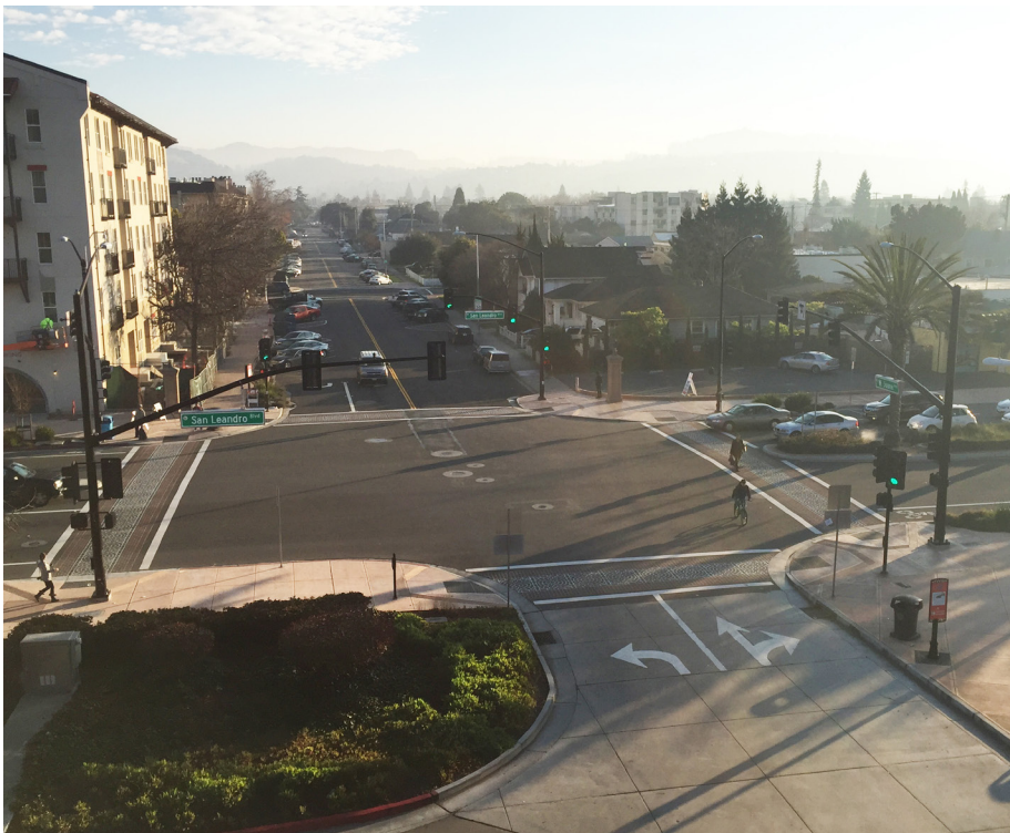
The recently redesigned intersection of San Leandro Boulevard and W Juana Avenue with curb extensions, audible pedestrian countdowns, and decorative crosswalks.

objects from potentially getting stuck in the gaps. It is especially important to ensure that the placement of the railroad crossing signal equipment still allows for a minimum of a 4 foot accessible sidewalk clearance.