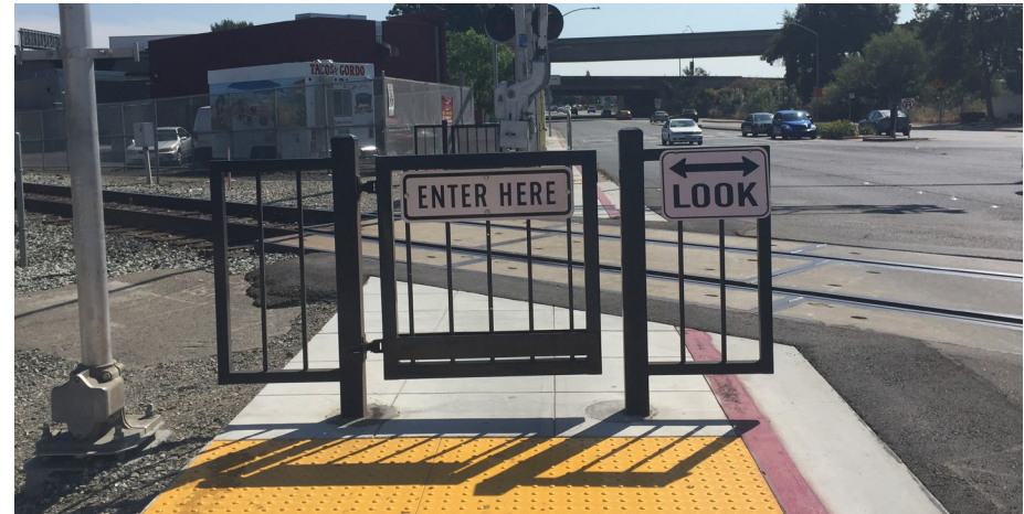
A railroad crossing improvement on Hesperian Boulevard.