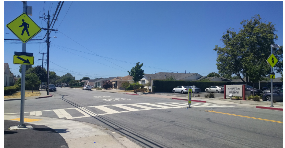
The Manor Boulevard/Inverness Street crossing across Manor by the library.