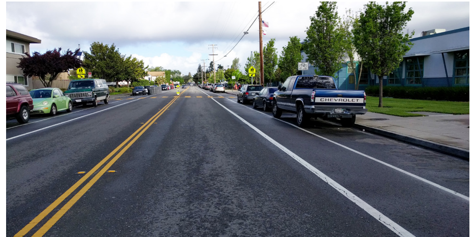
Bancroft Avenue near Jefferson Elementary.