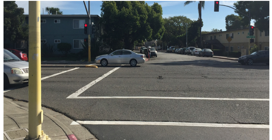
This intersection, Lewelling Boulevard/Tropic Court, had the highest volumes of pedestrian collisions (4) in the 2012-2015 reporting period.