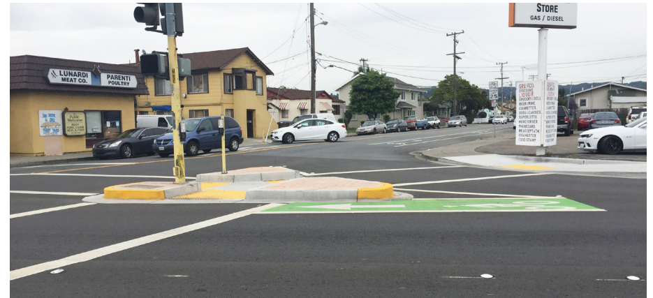
A pork chop island with free right turn lane and green bike lane at the intersection of San Leandro Boulevard and Williams Street.

C. Incorporate Streetscape Improvements and Public Space Additions into Future TOD Developments: As part of the City of San Leandro's Transit-Oriented Development (TOD) strategy, the BART parking lot to the east of the station and the formerly vacant area to the west of the station has become the San Leandro Tech Campus. These developments provide affordable and market-rate housing and additional office space in the Downtown. These and other TOD projects will contain a mixture of residential housing, retail and office uses, and the design of the streetscape and open spaces associated with the projects will be critical to enlivening the surrounding neighborhood. New sidewalks should be extra wide to accommodate commuters, provide pedestrian amenities, such as benches, and provide space for outdoor retail or restaurant use. Ensuring direct and efficient