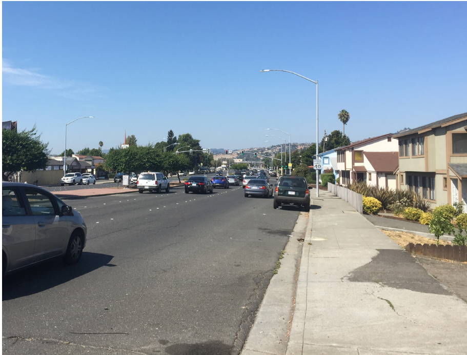
Hesperian Boulevard, north of I-238.

A. Bay Fair Transit Oriented Development Plan (currently in development) provides a plan for new land uses and circulation in the Bay Fair area of San Leandro. Part of this proposal includes a road diet for Hesperian Boulevard that would add a pedestrian and bicycle esplanade; providing greatly improved pedestrian and bicycle facilities along this critical corridor. Hesperian Boulevard provides key connections to Bay Fair BART and shopping areas at the Bayfair Center and in the southeast corner of San Leandro.