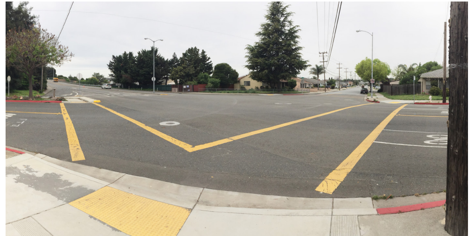
The Floresta Boulevard/Monterey Boulevard intersection

Throughout the City, many sidewalks, crosswalks, and curb ramps need to be upgraded to meet current ADA standards. ADA standards have evolved since many of the original accessibility improvements were implemented, and the City is working to make these upgrades to meet current standards. In many cases meeting ADA standards is a complex task because of the limited spatial resources.