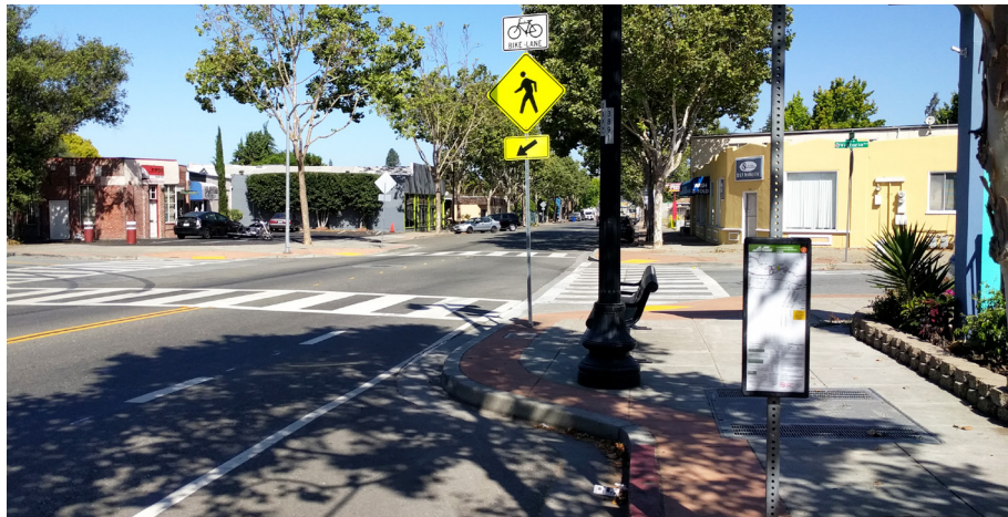
Curb extensions, street furniture, ladder crosswalks and street trees make this segment of MacArthur Boulevard more pleasant to walk along.