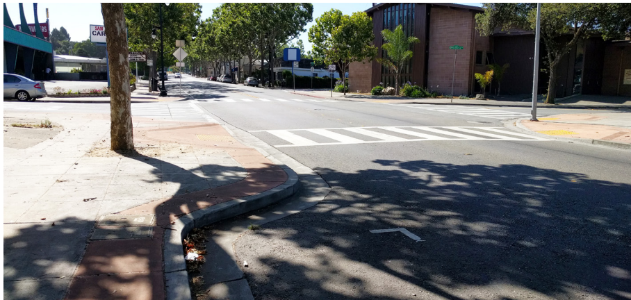
Recently improved pedestrian facilities along MacArthur Boulevard.