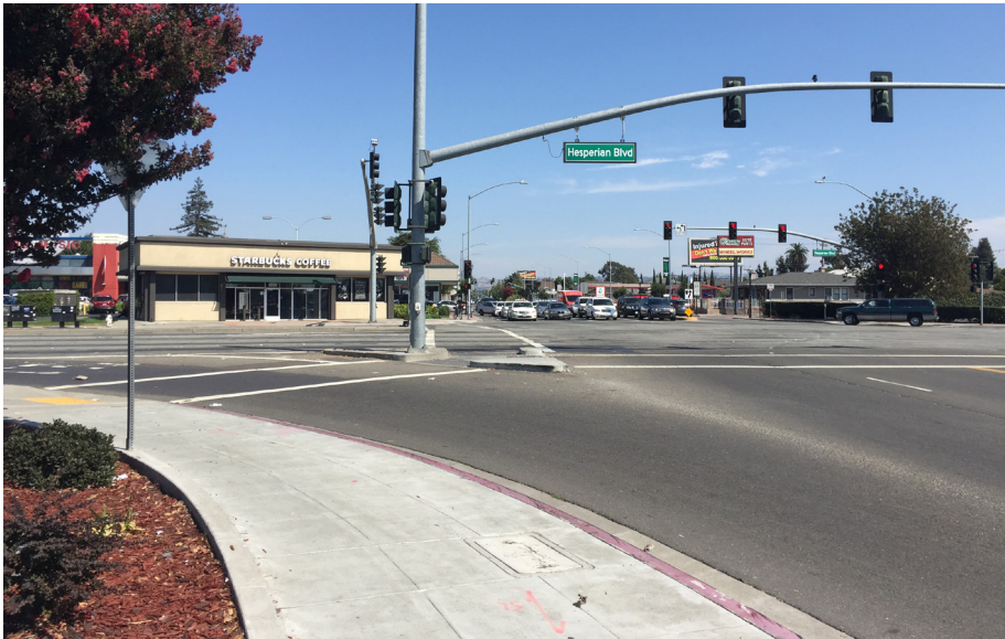
A free right turn lane at the intersection of Hesperian Boulevard and Lewelling Boulevard.