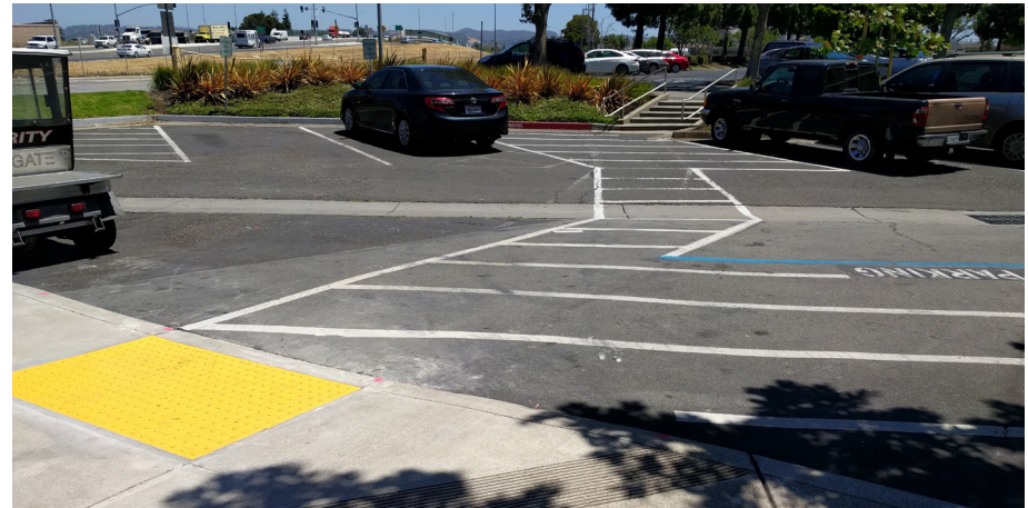
Internal circulation within the Westgate Center.