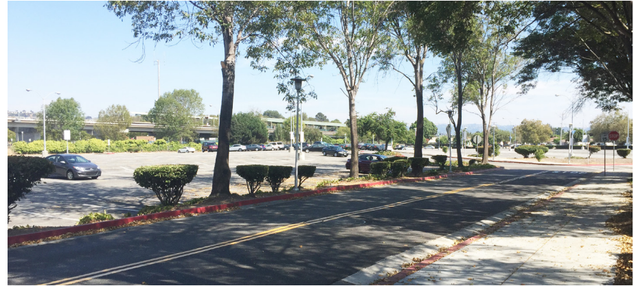
From Hesperian Boulevard, pedestrians access Bay Fair BART via Thornally Drive and a parking lot.

Throughout San Leandro, there are multiple intersections that have free right lanes (also known as slip-lanes), some with pork chop islands. Free right turn lanes are dangerous for both pedestrians and bicyclists. These turn lanes allow cars to quickly make right turns, usually only yielding to other traffic. Free right turn lanes change intersection geometry, creating additional conflict points for pedestrians and making it harder to bring bike lanes all the way to intersections. The City should strive to remove free right turn lanes and rebuild those intersections to more safely serve pedestrians and bicyclists.