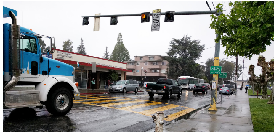
The existing mid-block crossing in front of the main San Leandro High campus.

the northwest corner to the southwest corner of Bancroft Avenue and Estudillo Avenue. To better accommodate this movement, new signals and a pedestrian scramble, similar to the one installed at Bancroft Avenue and 136th Avenue near San Leandro High School should be considered for this intersection.