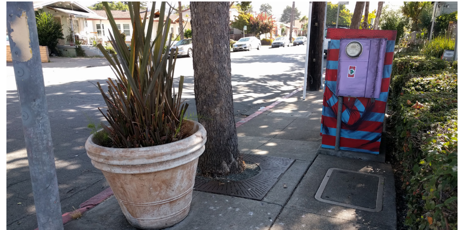
A congested sidewalk with planter, street tree and utility box, constraining sidewalk width for pedestrians, raising ADA concerns.