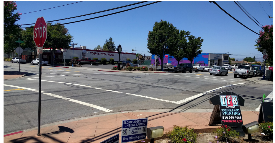
The intersection of Manor Boulevard and Farnsworth Street.