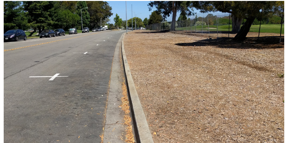
A mid-block crossing would improve safety and park accessibility for those who park on the east side of Monarch Bay Drive.