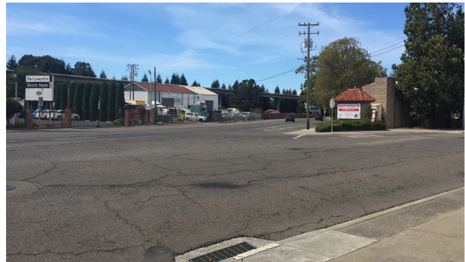
The intersection of San Leandro Boulevard, Park Street, and Best Avenue, is an asymmetrical partially stop controlled intersection near Siempre Verde Park.