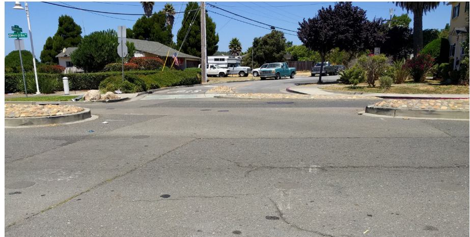
The Monarch Bay Drive/Neptune Drive intersection.

B. Create a Pedestrian Crossing at the Intersection of Monarch Bay Drive and Neptune Drive: This intersection is an important link between the Marina and adjacent neighborhood. The intersection has been designed with a median that prevents cars from turning left onto Neptune Drive from Monarch Bay Drive. Unfortunately, this median limits bicycle and pedestrian access to the neighborhood as well. This intersection should be redesigned to include a safe pedestrian crosswalk and bicycle entry. This project will be implemented as part of the shoreline redevelopment project.