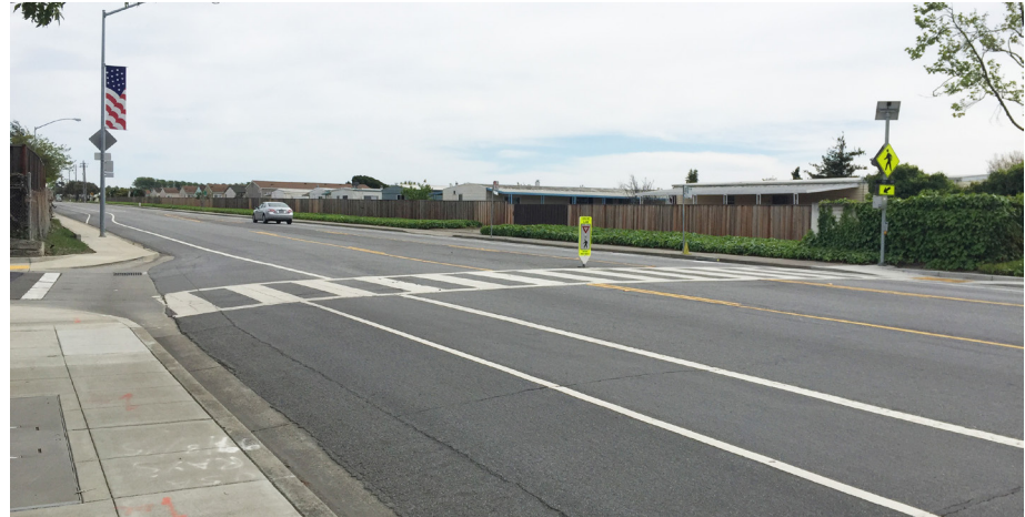
Wicks Boulevard crossing in front of Stenzel Park and the Marina Community Center with existing RRFBs.

7. Pacific Community Recreation Complex: Curb extensions should be considered for the intersection of Teagarden Street and Aladdin Avenue to reduce the crossing distance and improve pedestrian visibility. A new marked crosswalk and pedestrian actuated rectangular rapid flashing beacon should be considered for implementation at the intersection of Teagarden Drive and Montague Avenue.