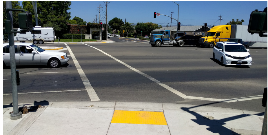
The Davis Street Crossing in front of the Westgate Center.