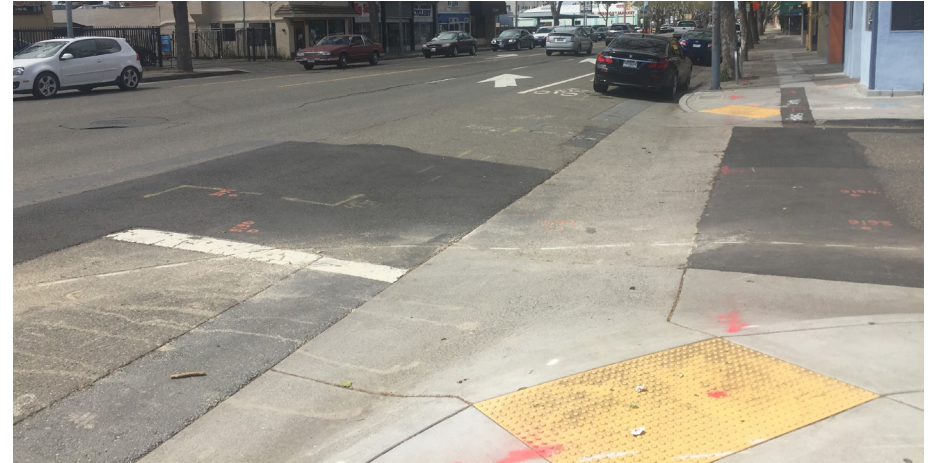
An unmarked crosswalk along East 14th Street near Euclid Avenue.

Streetscape enhancements should be prioritized for locations adjacent to major destinations identified in Figure 5 in Chapter 1. Streetscape enhancements should be of a similar palette to the improvements that have been recently installed in Downtown San Leandro and in the MacArthur Boulevard Pedestrian Improvement Area.