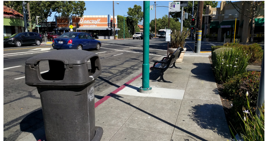
Street furniture and pedestrian amenities along Bancroft Avenue.

San Leandro has nearly 200 miles of roadway, which constitutes an enormous adjacent pedestrian network. The state of the pedestrian network varies greatly throughout the City. Much of the City is a walkable and pedestrian friendly environment, composed of small blocks, complete sidewalks, street trees and accessibility features. However, there are areas of the City that are inhospitable to pedestrians because of lack of or congested sidewalks, lack of street trees, long blocks, and lack of accessibility features. Additionally, there are some major barriers within the City that inhibit the connectivity of the pedestrian network. These barriers include railroad tracks (active and inactive) and freeways (I-238, I-580, and I 880), which run throughout San Leandro and limit the east to west pedestrian connectivity within the city, and also create