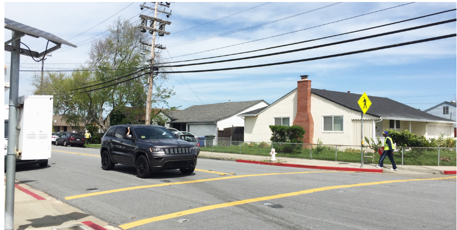
The crossing at Juniper Street and Purdue Street in front Madison Elementary.