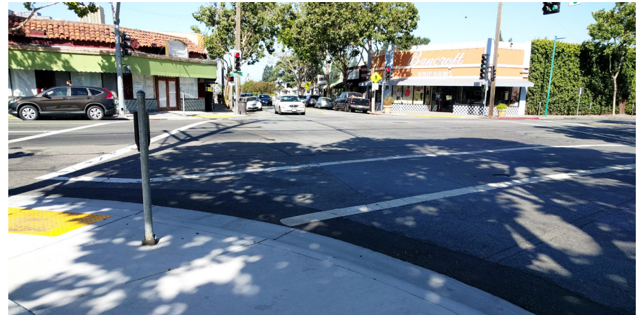
The intersection of Bancroft Avenue/Dutton Avenue