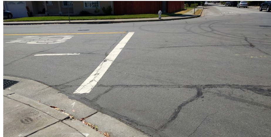
An intersection in the Marina without curb ramps and tactile surfaces.

The City of San Leandro developed an ADA Transition Plan in 1995 and updated that plan in 2010. As part of the update, the City performed a city-wide survey of its existing facilities to identify barriers for accessibility.