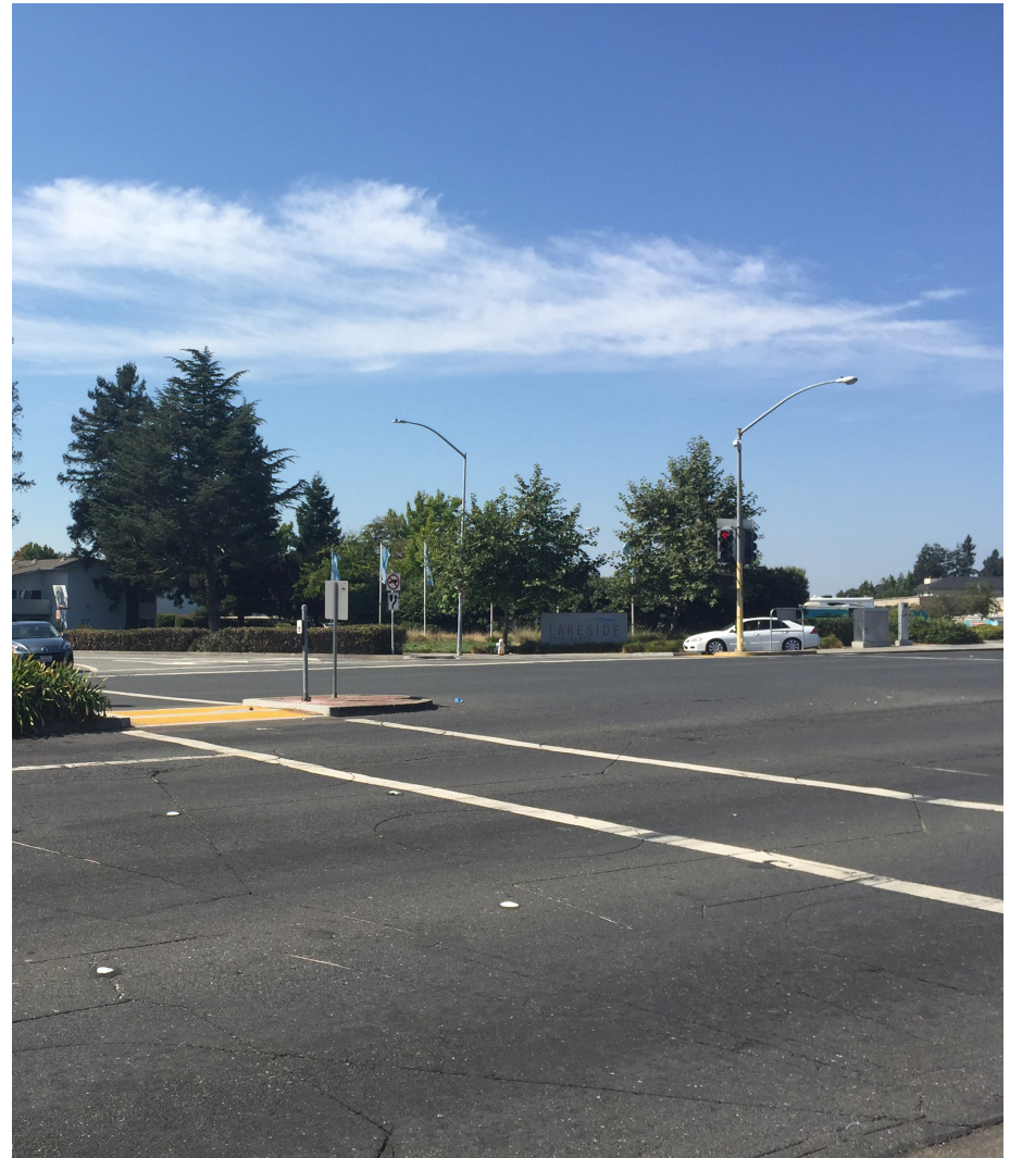
Part of the crossing across Hesperian Boulevard at Springlake Drive.