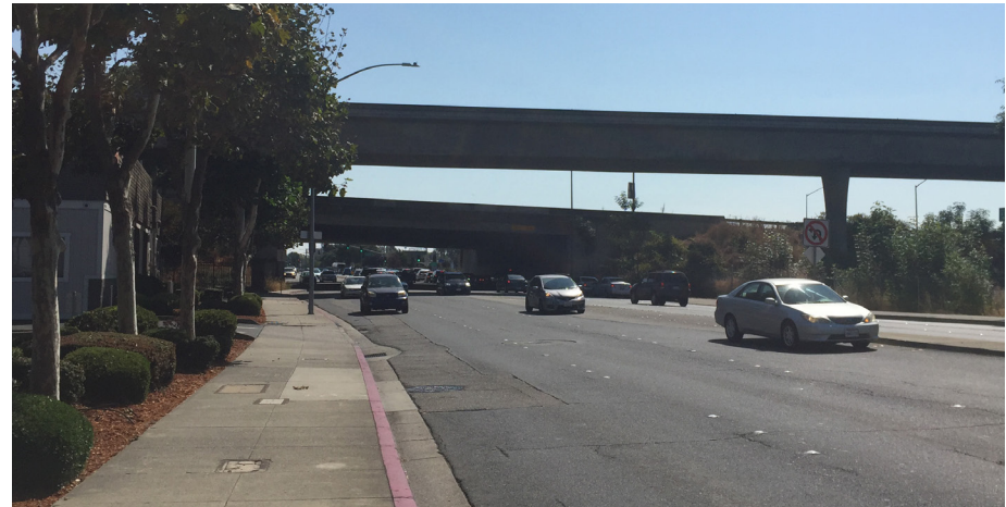
A series of highway underpass for I-238 over Hesperian Boulevard near Lewelling Boulevard.

22. Freeway Undercrossings for I-238, I-580, and I-880: San Leandro has three freeways that run through it: I-238 in the Bay Fair area, I-580 in the east, and I-880 running through the middle of the City. When the crossings are established with underpasses, the City should work with Caltrans to improve pedestrian facilities in these areas including sidewalks, lighting, and traffic calming; especially, if there are freeway ramps nearby.