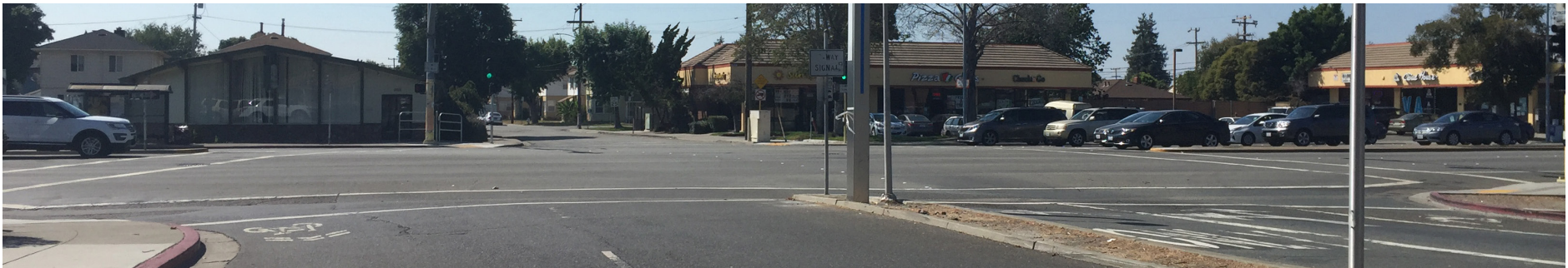
The intersection of Hesperian Boulevard and Thornally Drive. There was a pedestrian fatality at this intersection in 2015.

C. Hesperian Boulevard/Bayfair Drive, Hesperian Boulevard/Fairmont Drive Intersections, and Hesperian/Thornally Drive: Redesign of these intersections should include curb extensions and/or pedestrian refuge islands to reduce pedestrian crossing distances and improve pedestrian safety at these major, large intersections.