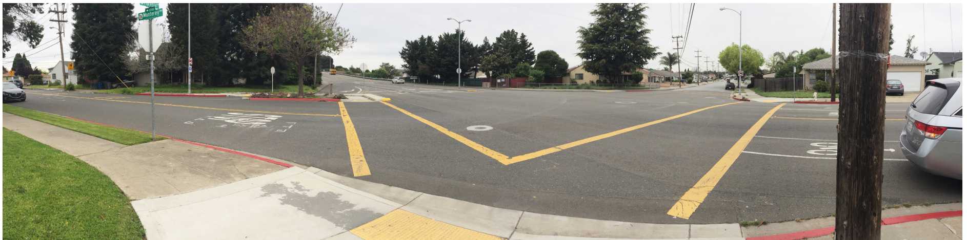
The wide intersection of Floresta Boulevard/Monterey Road.

11. San Leandro Boulevard/Washington Avenue Intersection: New Accessible Pedestrian Signals have been recently installed at this intersection to improve accessibility of the crossing. To further improve safety at this intersection, the City should analyze the feasibility of removing the free right turn lane and installing new curb extensions and pedestrian refuge islands.