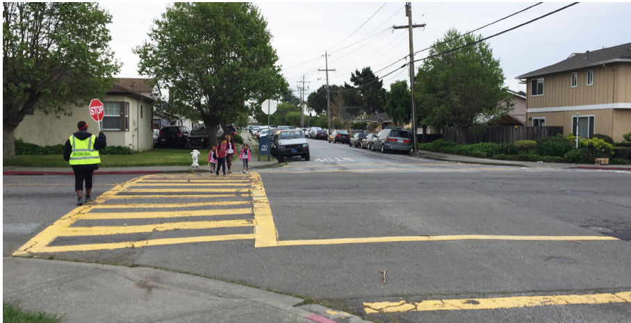
A crossing guard assists families crossing Marina Boulevard near Garfield Elementary.