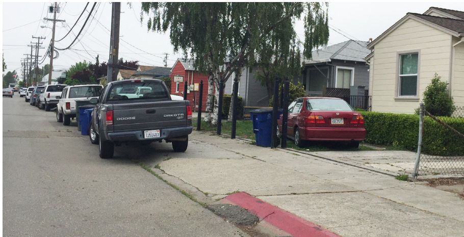
Cars parked on sidewalks with rolled curbs in the Manor neighborhood.