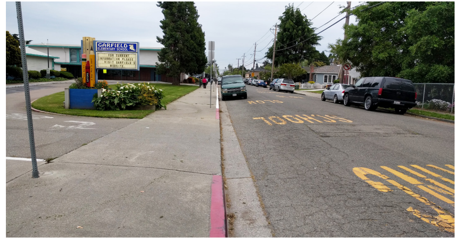
Garfield Elementary's frontage on Aurora Drive.

1. Garfield Elementary School: There is a yellow high-visibility crosswalk on Marina Boulevard, which should be repainted to maintain its visibility. School Warning signage should be placed in advance of the crosswalk and School Crosswalk Warning signs should be placed adjacent to the crosswalk to warn drivers of the potential of children crossing at this intersection. Curb extensions should be considered at this intersection (Marina Boulevard/Aurora Drive) to increase the visibility of students crossing at this location and decrease the crossing distance. The Shoreline EIR requires intersection improvements be made at this intersection, which can include the aforementioned treatments. A traffic signal is also planned to be installed at that intersection. Similar crossing improvements should also be considered at the intersections of Aurora Drive/Walnut Drive and Aurora Drive/West Avenue 130th. For the full improvement plan, please see Appendix G.