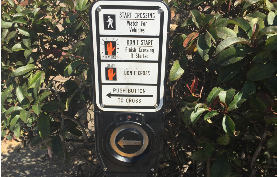
An ADA compliant pedestrian push button along Hesperian Boulevard.

In 2017, the City conducted a two-phase curb ramp assessment in two parts of the City. Phase one was in the downtown area and phase two was in the Manor neighborhood. The findings from these assessments will be used to guide the City's aforementioned budget to make improvements in these areas and throughout the City. San Leandro should plan future assessment phases to study the remaining areas of the City.