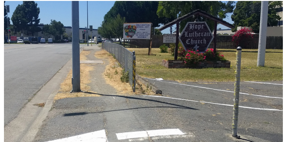
An unpaved segment of sidewalk along Manor Boulevard.

There are instances within the City of San Leandro where the sidewalks are not up to standard for a number of reasons. In many cases, sidewalks are old and their age has caused the surface to crack and cause abrupt level changes. Additionally, sidewalks are frequently obstructed by signs, poles, benches, or other streetscape amenities, which encroach on the minimum 4 foot sidewalk. There are also areas within the City where there may be gaps in the existing sidewalk network. As part of the ADA Transition Plan, the City should conduct an audit of the sidewalks and identify locations that need to be updated to meet the minimum ADA requirements. These areas should be prioritized by the City based upon their proximity to major destinations.