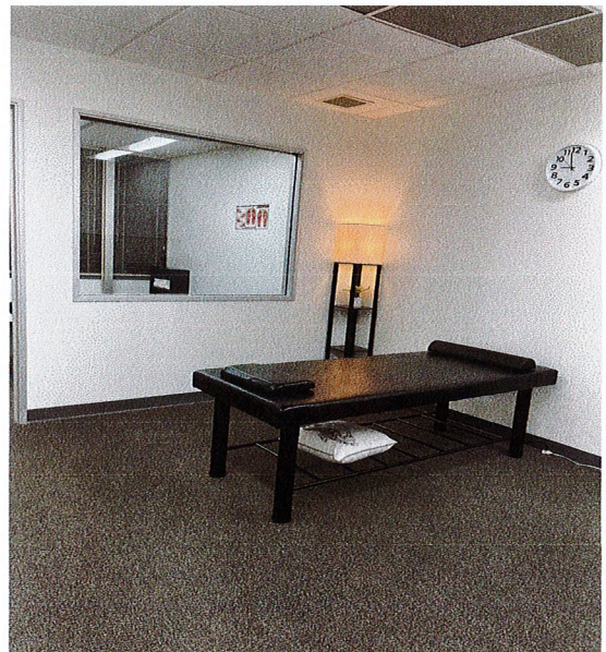
Therapeutic Masseuse's office