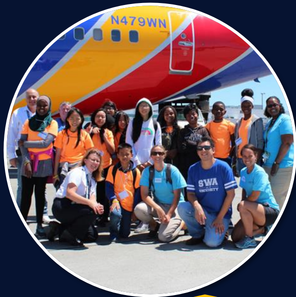
Aviation Day – Career & STEM Awareness