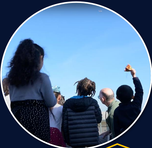
Port Science Day – James Madison Elementary