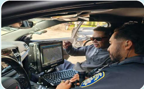
CAD-RMS Replacement $3M