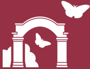
Exhibit to Presentation