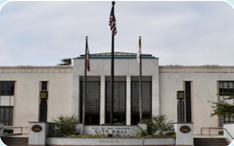
City Hall Painting $500k