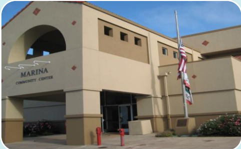
Marina Community Center Painting $500k