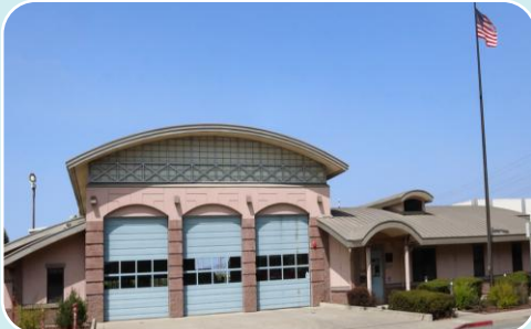
Fire Station #10 Roof Replacement $625k