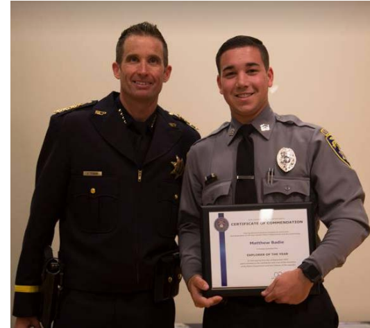
HIGH SCHOOL AGE