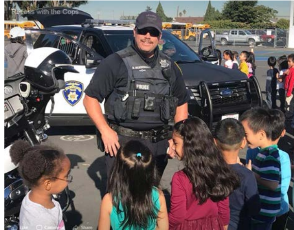
ELEMENTARY SCHOOL AGE