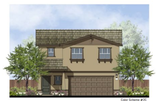
Elevation B - Craftsman