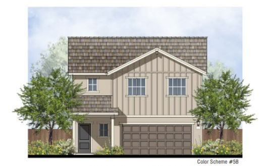
Elevation A - Farmhouse