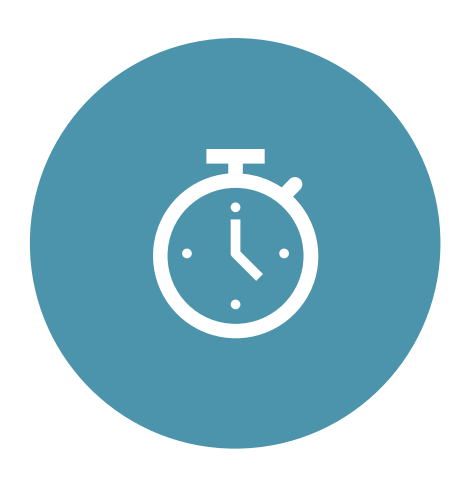
JULY 18 - DECLARE INTENT SEPTEMBER 9 - PUBLIC HEARING AND INTRODUCTION OF ORDINANCE TO FORM CFD