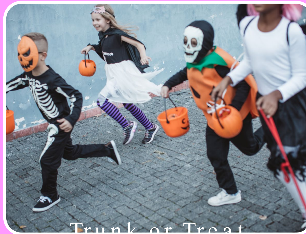
Trunk or Treat