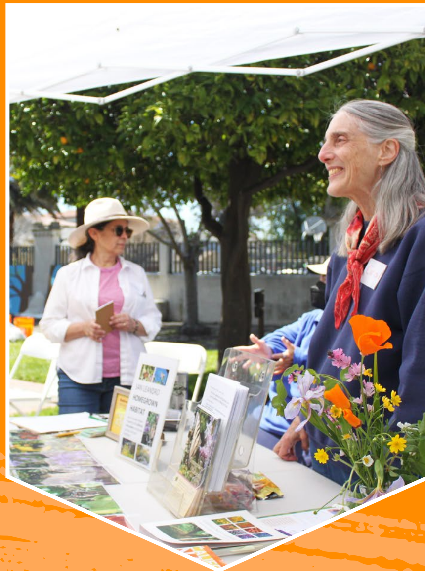
SAN LEANDRO FAMILY EARTH DAY FESTIVAL