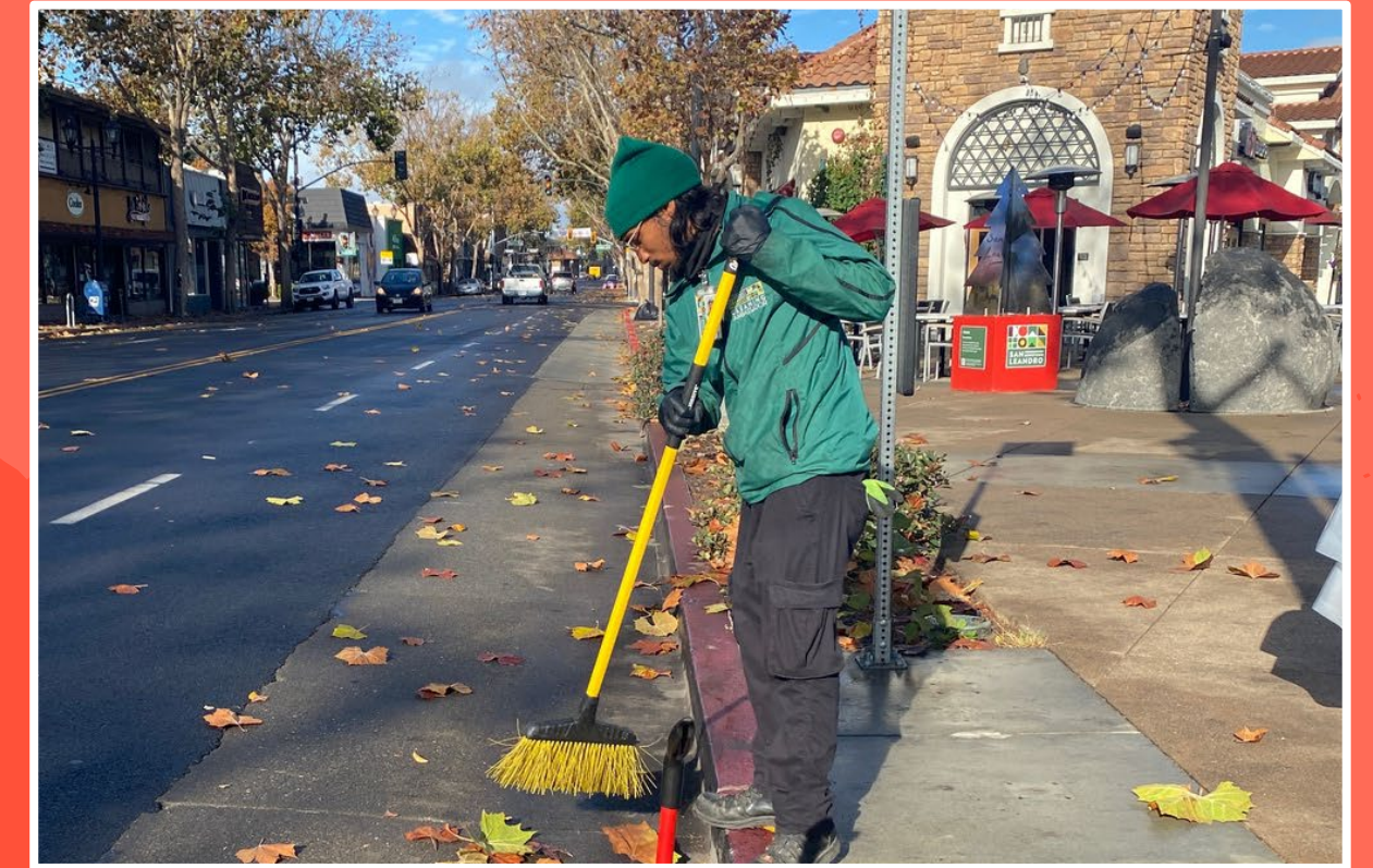
Cleaning Ambassadors On Duty Daily 7:00 am - 3:30 pm