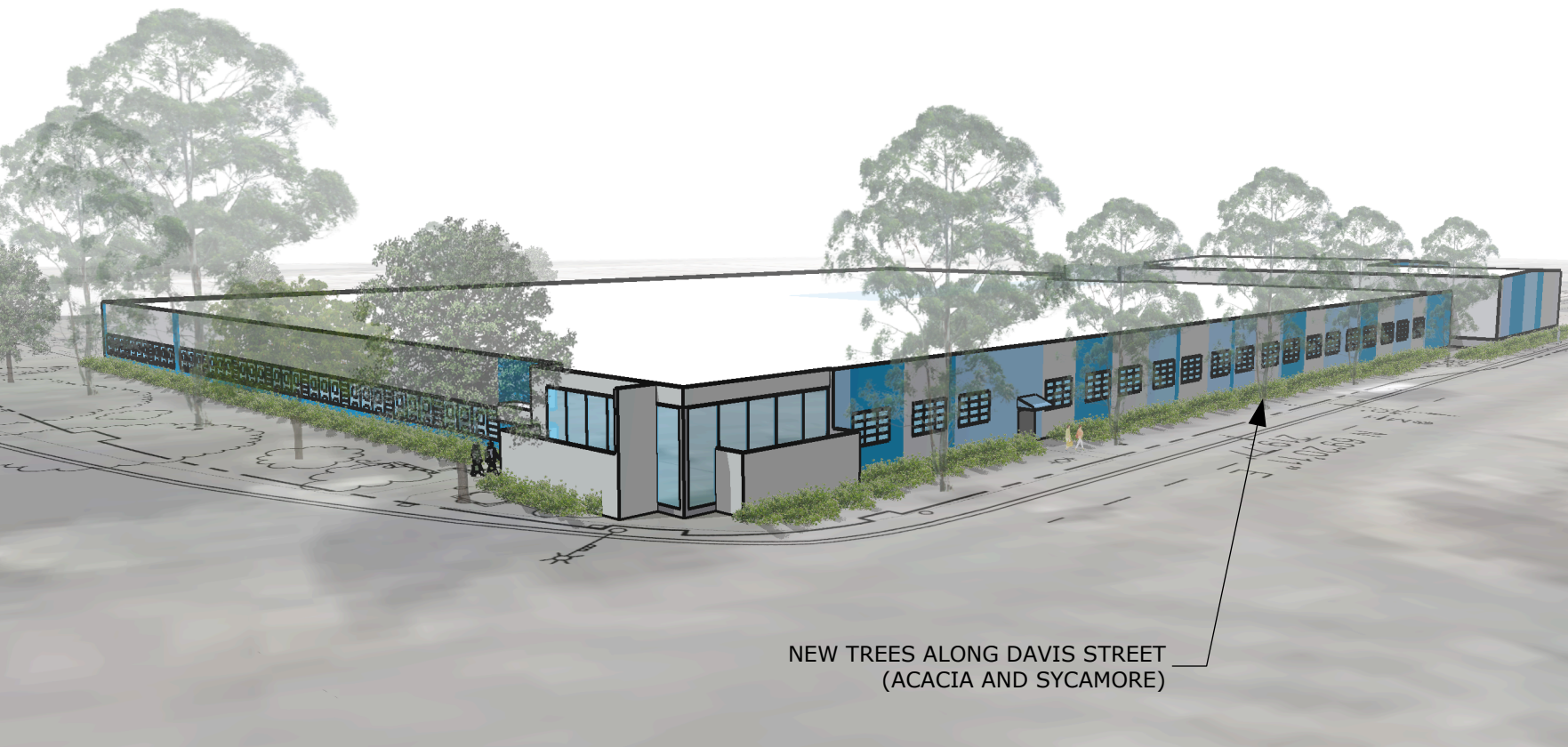
B VIEW LOOKING WEST Scale: NONE