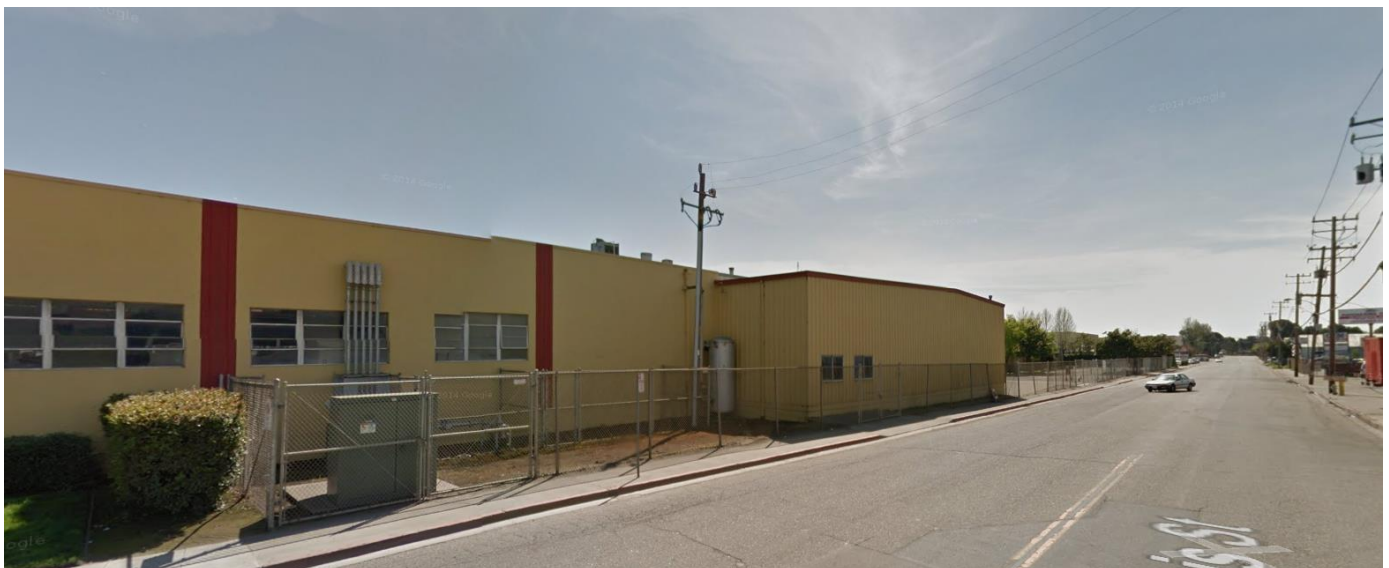
Northern building elevation and chainlink fencing facing Davis Street, looking westbound