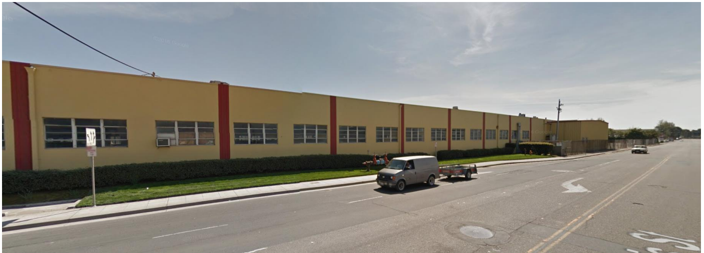
Northern building elevation facing Davis Street (windows to be retained and new trees planted)