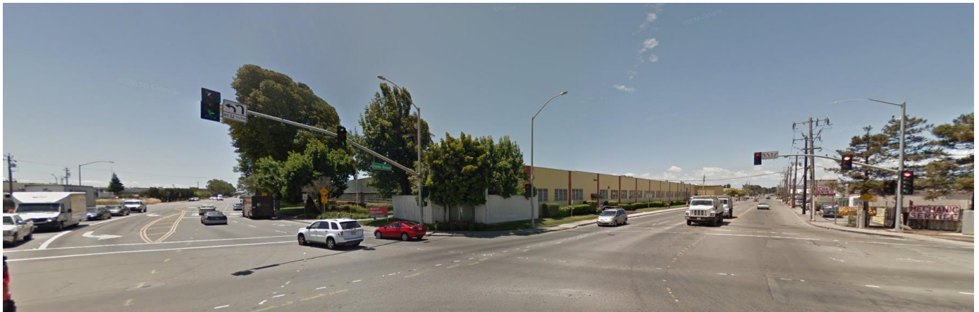
1251 Doolittle Drive, southwest corner of Doolittle Drive and Davis Street intersection (building will be repainted)

PLN16-0032; Conditional Use Permit application, 1251 Doolittle Drive