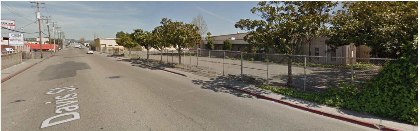
Chainlink fencing facing Davis Street, looking eastbound, that will be replaced with decorative fencing