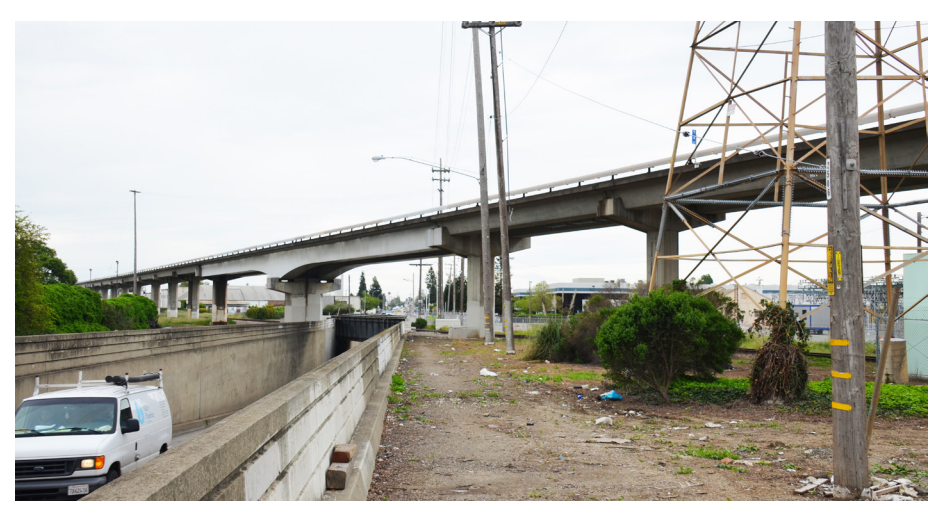
A potential alignment of a pedestrian facility next to the Washington tunnel.