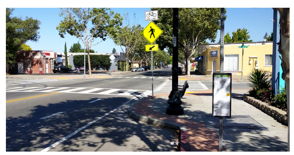
Curb extensions, street furniture, ladder crosswalks and street trees make this segment of MacArthur Boulevard more pleasant to walk along.

Streetscape enhancements should be prioritized for locations adjacent to major destinations identified in Figure 5 in Chapter 1. Streetscape enhancements should be of a similar palette to the improvements that have been recently installed in Downtown San Leandro and in the MacArthur Boulevard Pedestrian Improvement Area.