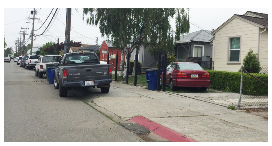
Cars parked on sidewalks with rolled curbs in the Manor neighborhood.