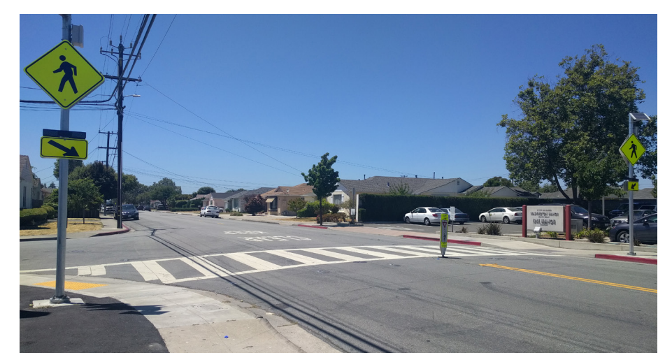
The Manor Boulevard/Inverness Street crossing across Manor by the library.