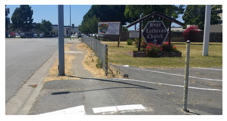
An unpaved segment of sidewalk along Manor Boulevard.

There are instances within the City of San Leandro where the sidewalks are not up to standard for a number of reasons. In many cases, sidewalks are old and their age has caused the surface to crack and cause abrupt level changes. Additionally, sidewalks are frequently obstructed by signs, poles, benches, or other streetscape amenities, which encroach on the minimum 4 foot sidewalk. There are also areas within the City where there may be gaps in the existing sidewalk network. As part of the ADA Transition Plan, the City should conduct an audit of the sidewalks and identify locations that need to be updated to meet the minimum ADA requirements. These areas should be prioritized by the City based upon their proximity to major destinations.