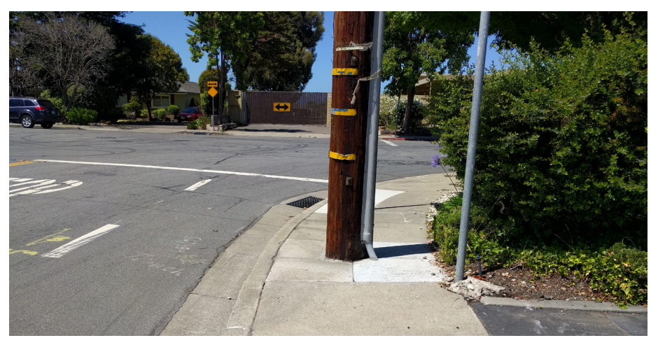
An obstructed sidewalk in the Marina neighborhood.