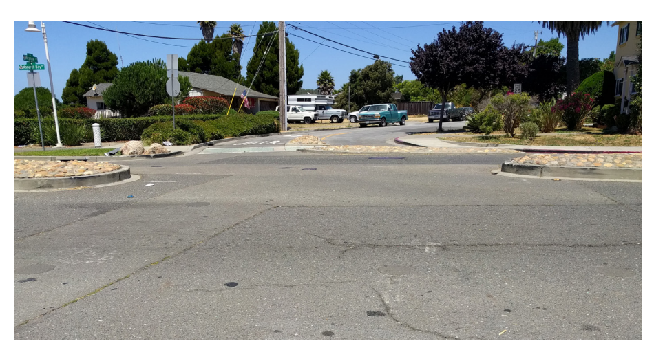
The Monarch Bay Drive/Neptune Drive intersection.