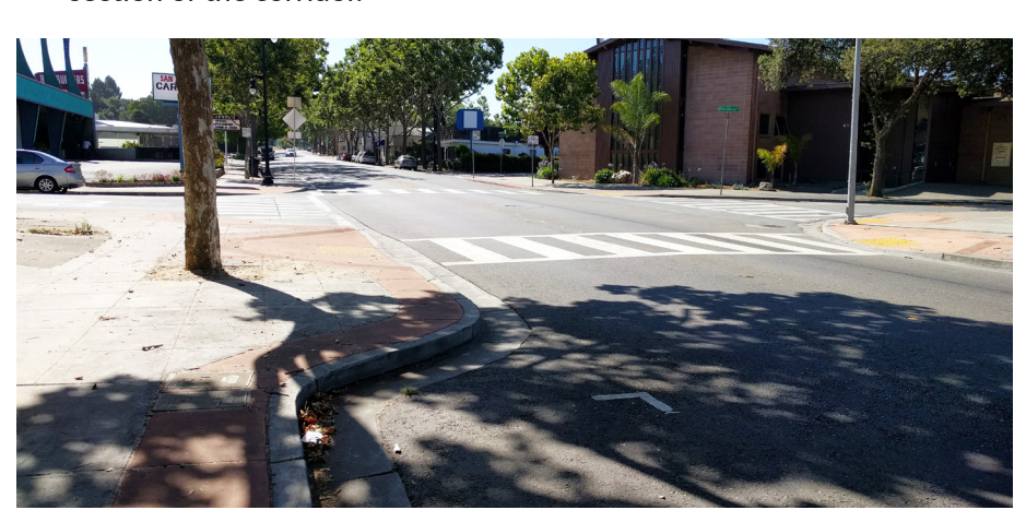
Recently improved pedestrian facilities along MacArthur Boulevard.