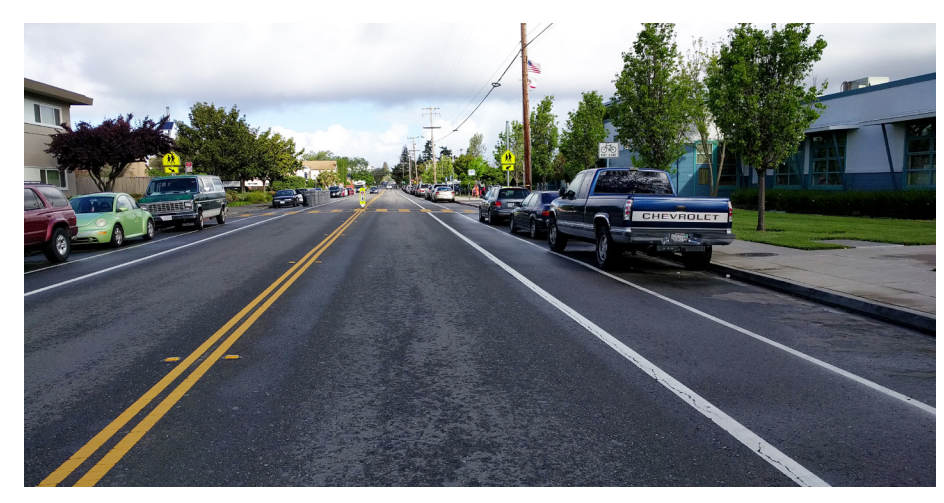
Bancroft Avenue near Jefferson Elementary.