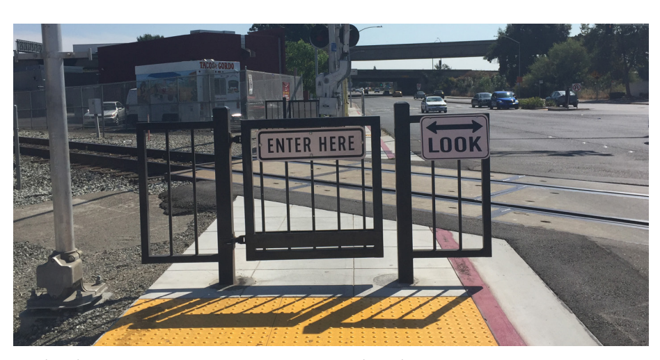
A railroad crossing improvement on Hesperian Boulevard.