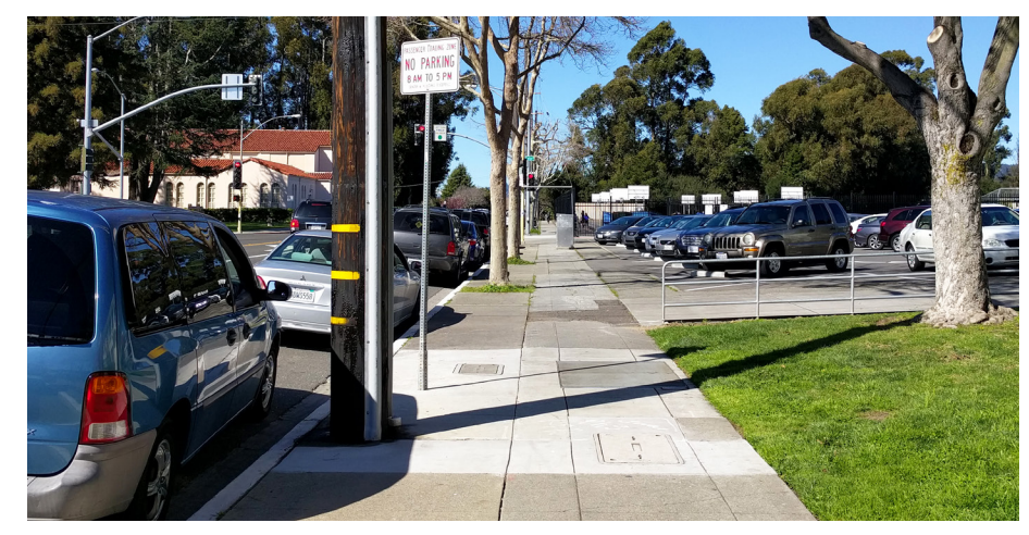
Bancroft Avenue sidewalks in front of Bancroft Middle School.