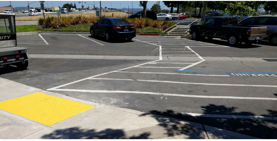
Internal circulation within the Westgate Center.