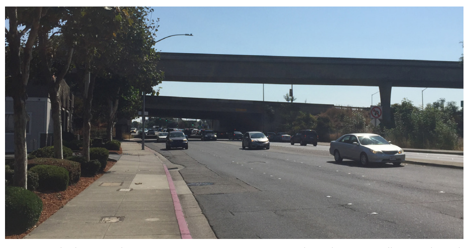
A series of highway underpass for I-238 over Hesperian Boulevard near Lewelling Boulevard.