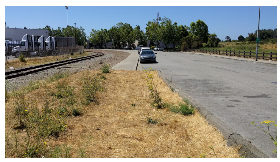
The sidewalk on the north side of Neptune Drive stops short of the Oyster Bay Regional Park entrance.