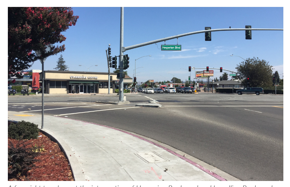
A free right turn lane at the intersection of Hesperian Boulevard and Lewelling Boulevard.

Throughout San Leandro, there are multiple intersections that have free right lanes (also known as slip-lanes), some with pork chop islands. Free right turn lanes are dangerous for both pedestrians and bicyclists. These turn lanes allow cars to quickly make right turns, usually only yielding to other traffic. Free right turn lanes change intersection geometry, creating additional conflict points for pedestrians and making it harder to bring bike lanes all the way to intersections. The City should strive to remove free right turn lanes and rebuild those intersections to more safely serve pedestrians and bicyclists.