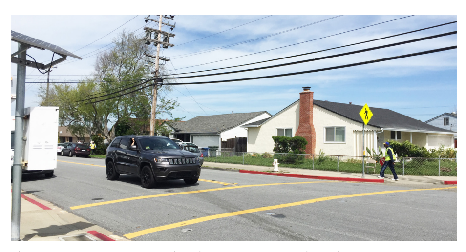
The crossing at Juniper Street and Purdue Street in front Madison Elementary.