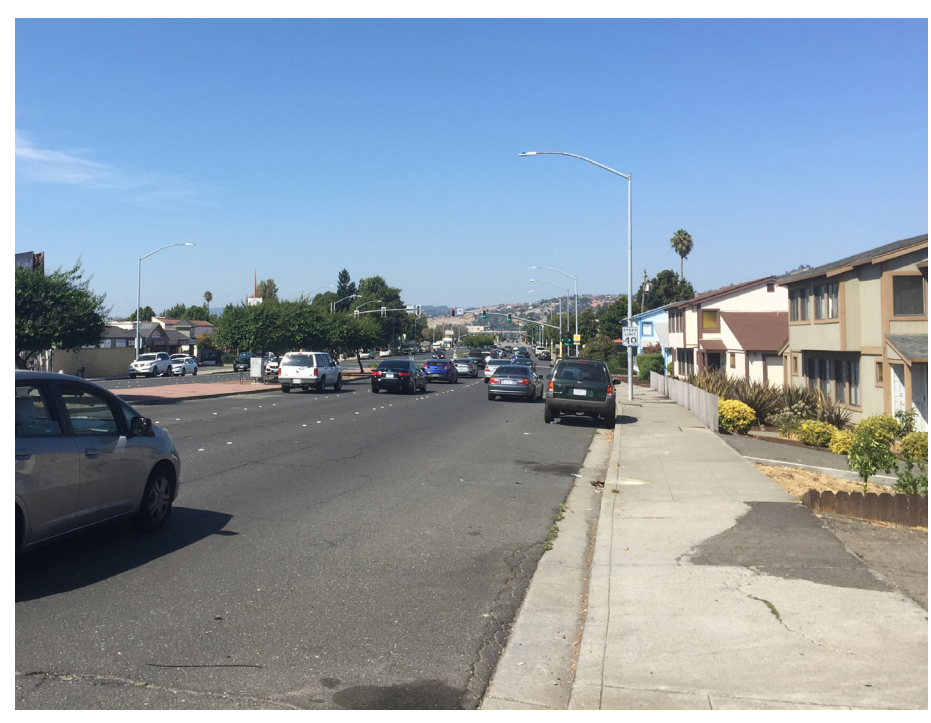
Hesperian Boulevard, north of I-238.

A. Bay Fair Transit Oriented Development Plan (currently in development) provides a plan for new land uses and circulation in the Bay Fair area of San Leandro. Part of this proposal includes a road diet for Hesperian Boulevard that would add a pedestrian and bicycle esplanade; providing greatly improved pedestrian and bicycle facilities along this critical corridor. Hesperian Boulevard provides key connections to Bay Fair BART and shopping areas at the Bayfair Center and in the southeast corner of San Leandro.