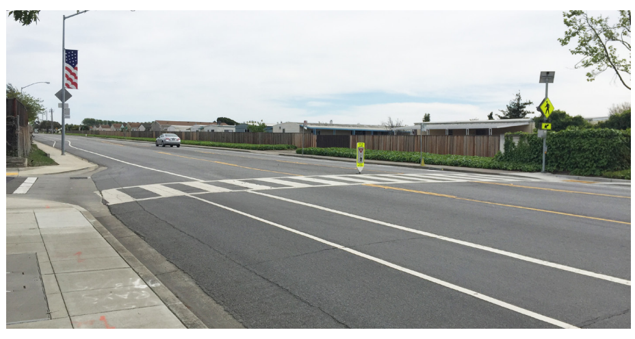
Wicks Boulevard crossing in front of Stenzel Park and the Marina Community Center with existing RRFBs.