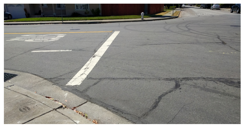
An intersection in the Marina without curb ramps and tactile surfaces.

The City of San Leandro developed an ADA Transition Plan in 1995 and updated that plan in 2010. As part of the update, the City performed a citywide survey of its existing facilities to identify barriers for accessibility.