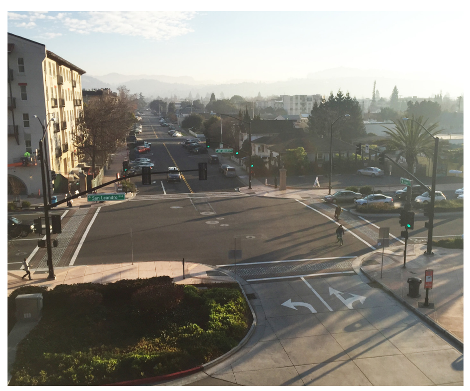
The recently redesigned intersection of San Leandro Boulevard and W Juana Avenue with curb extensions, audible pedestrian countdowns, and decorative crosswalks.

objects from potentially getting stuck in the gaps. It is especially important to ensure that the placement of the railroad crossing signal equipment still allows for a minimum of a 4 foot accessible sidewalk clearance.