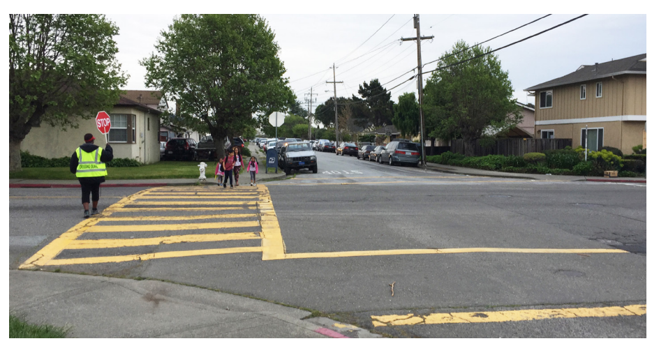
A crossing guard assists families crossing Marina Boulevard near Garfield Elementary.