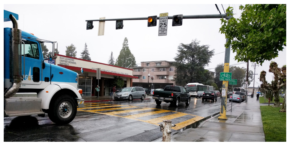
The existing mid-block crossing in front of the main San Leandro High campus.

the northwest corner to the southwest corner of Bancroft Avenue and Estudillo Avenue. To better accommodate this movement, new signals and a pedestrian scramble, similar to the one installed at Bancroft Avenue and 136th Avenue near San Leandro High School should be considered for this intersection.