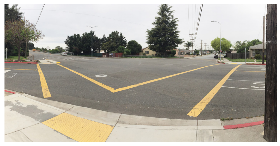
The Floresta Boulevard/Monterey Boulevard intersection

Throughout the City, many sidewalks, crosswalks, and curb ramps need to be upgraded to meet current ADA standards. ADA standards have evolved since many of the original accessibility improvements were implemented, and the City is working to make these upgrades to meet current standards. In many cases meeting ADA standards is a complex task because of the limited spatial resources.