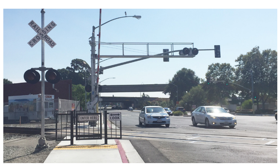
Improved pedestrian crossing features of the Niles Subdivision along Hesperian Boulevard.