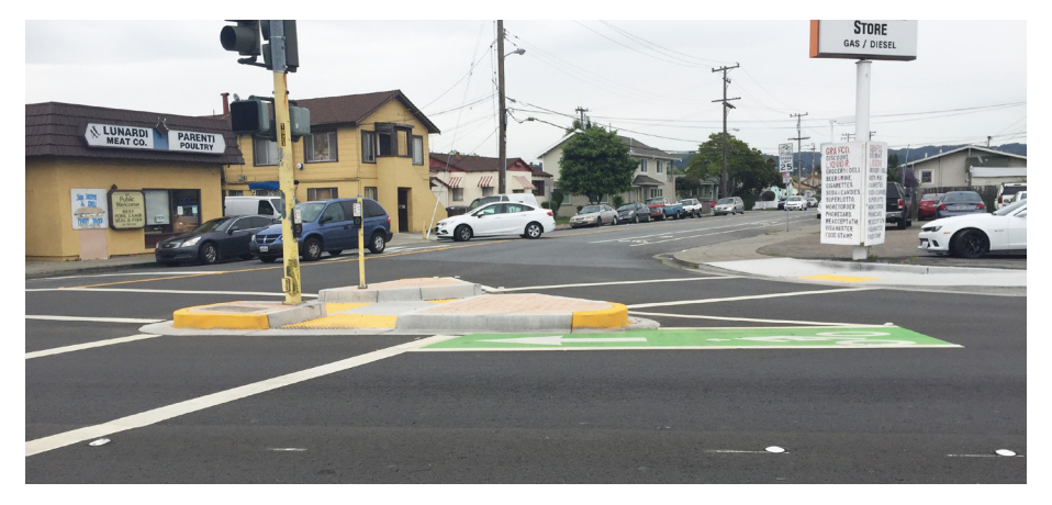
A pork chop island with free right turn lane and green bike lane at the intersection of San Leandro Boulevard and Williams Street.

connections to BART and nearby buses should be part of any future project and these connections should be retrofitted into existing projects if necessary to improve connectivity.