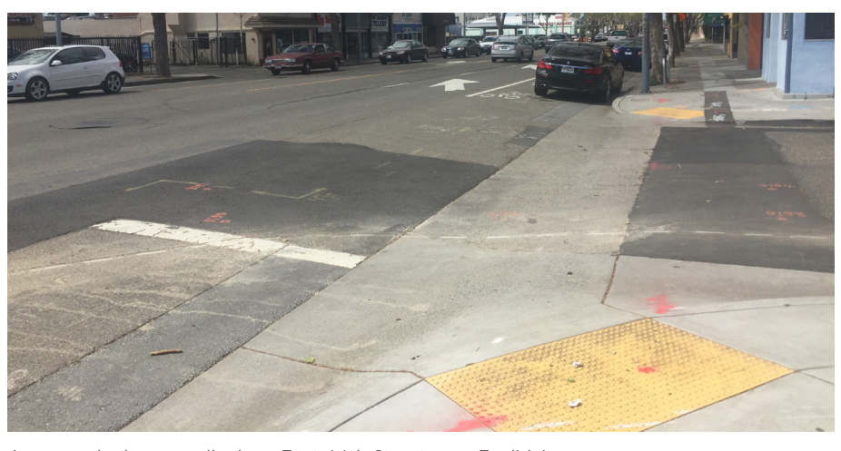
An unmarked crosswalk along East 14th Street near Euclid Avenue.