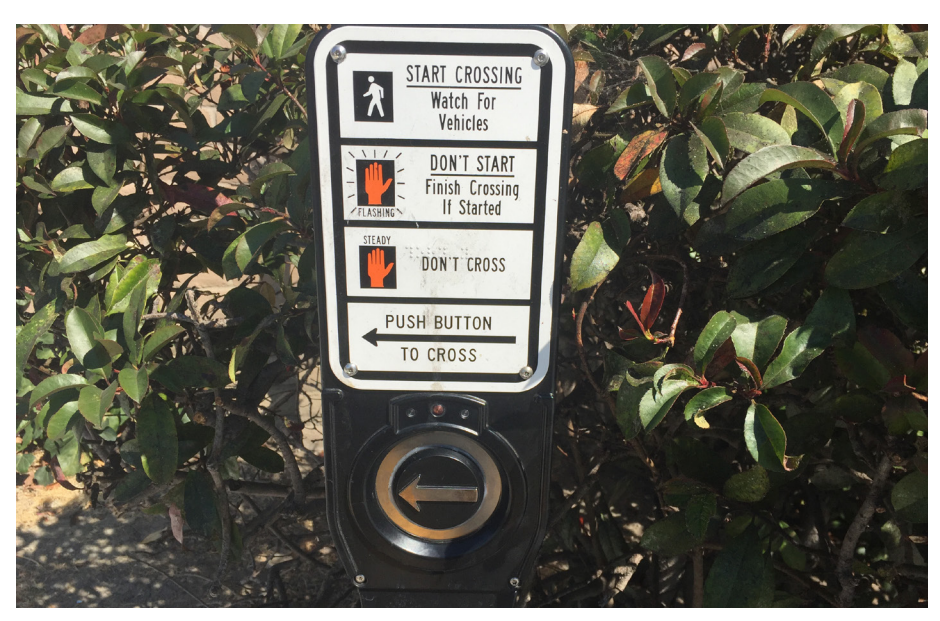
An ADA compliant pedestrian push button along Hesperian Boulevard.

In 2017, the City conducted a two-phase curb ramp assessment in two parts of the City. Phase one was in the downtown area and phase two was in the Manor neighborhood. The findings from these assessments will be used to guide the City's aforementioned budget to make improvements in these areas and throughout the City. San Leandro should plan future assessment phases to study the remaining areas of the City.