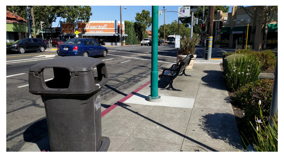
Street furniture and pedestrian amenities along Bancroft Avenue.

San Leandro has nearly 200 miles of roadway, which constitutes an enormous adjacent pedestrian network. The state of the pedestrian network varies greatly throughout the City. Much of the City is a walkable and pedestrian friendly environment, composed of small blocks, complete sidewalks, street trees and accessibility features. However, there are areas of the City that are inhospitable to pedestrians because of lack of or congested sidewalks, lack of street trees, long blocks, and lack of accessibility features. Additionally, there are some major barriers within the City that inhibit the connectivity of the pedestrian network. These barriers include railroad tracks (active and inactive) and freeways (I-238, I-580, and I 880), which run throughout San Leandro and limit the east to west pedestrian connectivity within the city, and also create