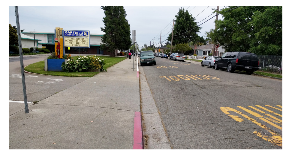
Garfield Elementary's frontage on Aurora Drive.

1.Garfield Elementary School: There is a yellow high-visibility crosswalk on Marina Boulevard, which should be repainted to maintain its visibility. School Warning signage should be placed in advance of the crosswalk and School Crosswalk Warning signs should be placed adjacent to the crosswalk to warn drivers of the potential of children crossing at this intersection. Curb extensions should be considered at this intersection (Marina Boulevard/Aurora Drive) to increase the visibility of students crossing at this location and decrease the crossing distance. The Shoreline EIR requires intersection improvements be made at this intersection, which can include the aforementioned treatments. A traffic signal is also planned to be installed at that intersection. Similar crossing improvements should also be considered at the intersections of Aurora Drive/Walnut Drive and Aurora Drive/West Avenue 130th. For the full improvement plan, please see Appendix G.