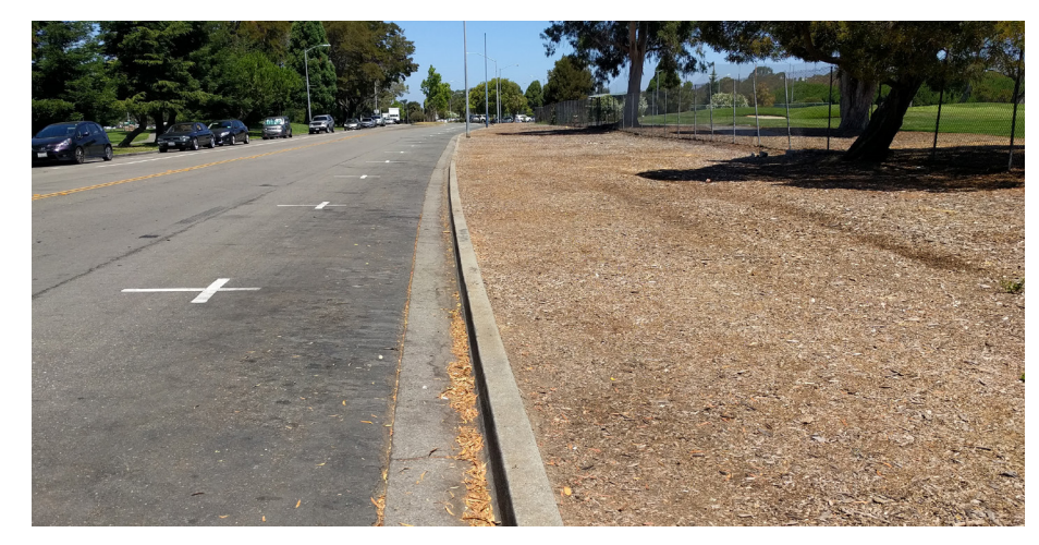
A mid-block crossing would improve safety and park accessibility for those who park on the east side of Monarch Bay Drive.