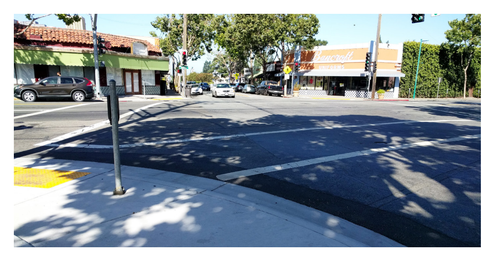
The intersection of Bancroft Avenue/Dutton Avenue