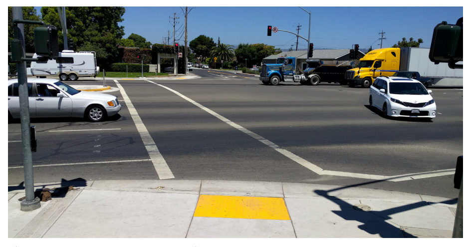
The Davis Street Crossing in front of the Westgate Center.

Shopping Center, the intersection of Timothy Drive and Davis Street, and the area along West Gate Parkway.