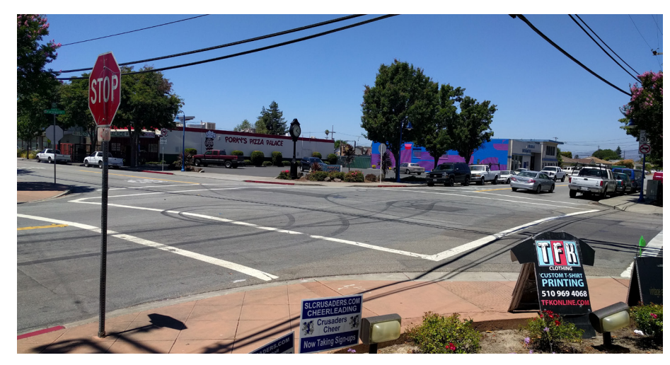
The intersection of Manor Boulevard and Farnsworth Street.