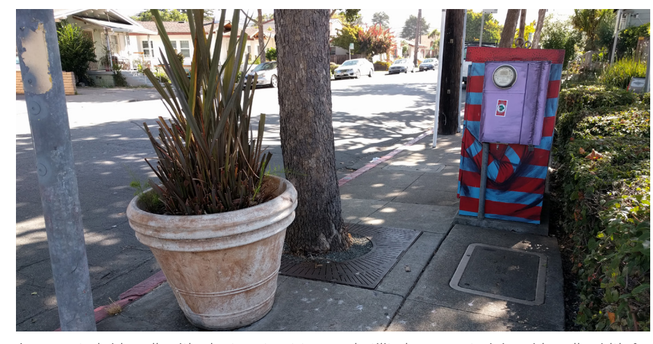
A congested sidewalk with planter, street tree and utility box, constraining sidewalk width for pedestrians, raising ADA concerns.