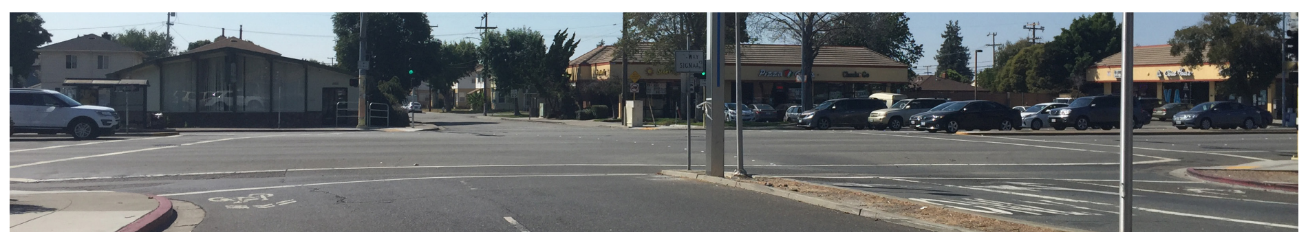
The intersection of Hesperian Boulevard and Thornally Drive. There was a pedestrian fatality at this intersection in 2015.