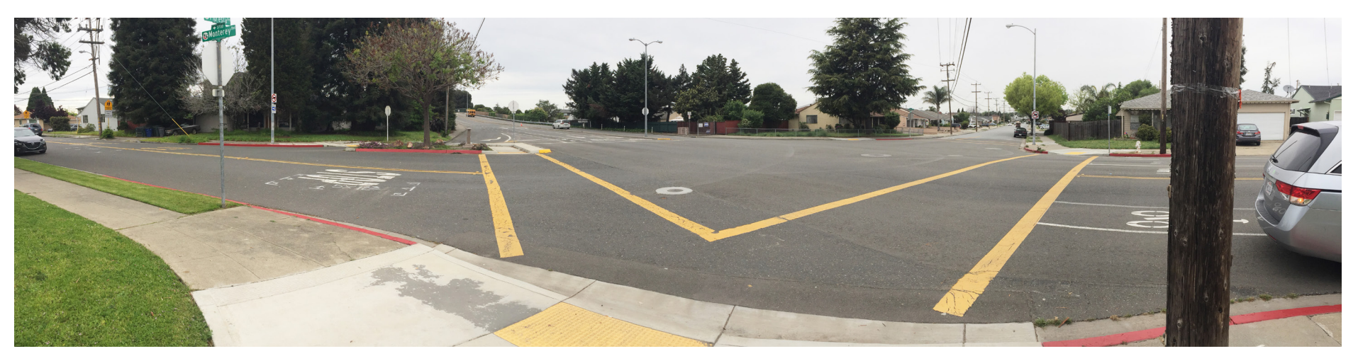
The wide intersection of Floresta Boulevard/Monterey Road.