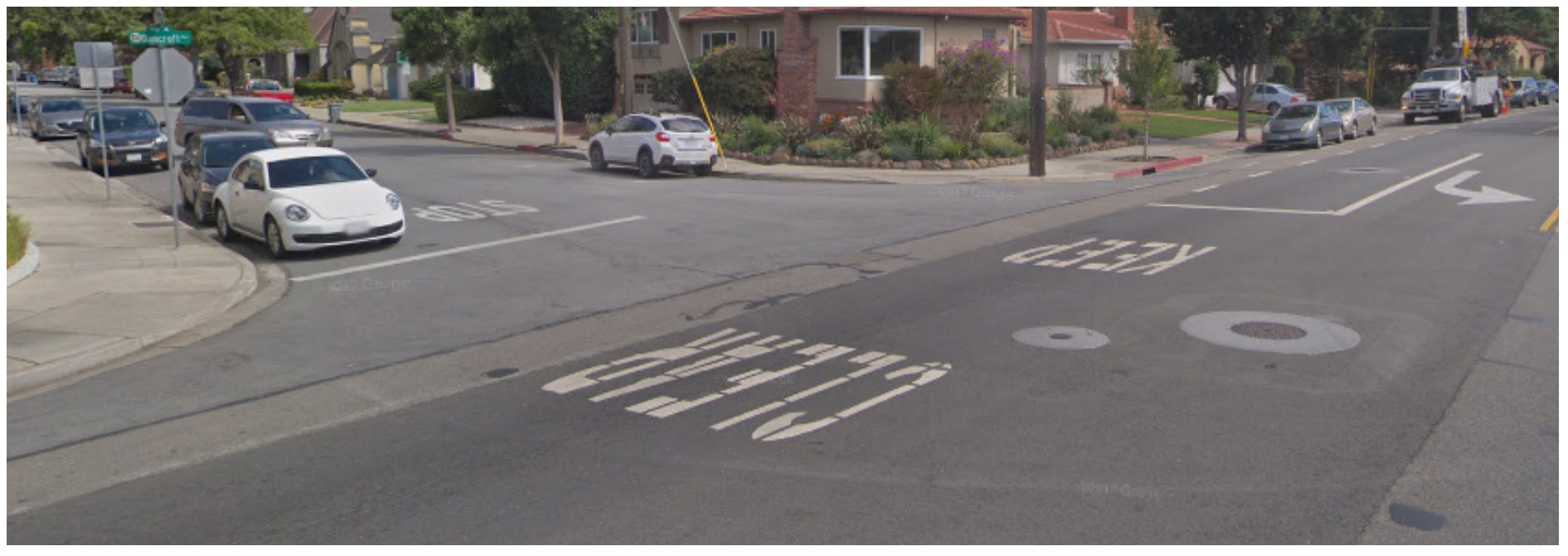
One of the approaches of the Bancroft Avenue/Oakes Drive Intersection, looking eastward towards Oakes across Bancroft Avenue.