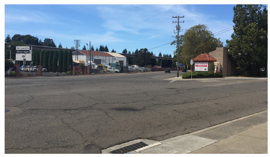
The intersection of San Leandro Boulevard, Park Street, and Best Avenue, is an asymmetrical partially stop controlled intersection near Siempre Verde Park.