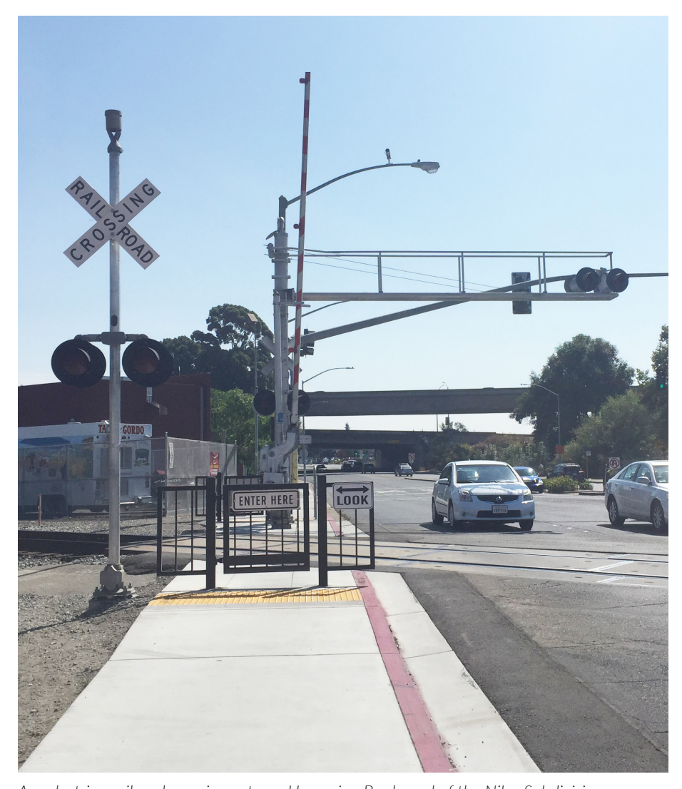
A pedestrian railroad crossing gate on Hesperian Boulevard of the Niles Subdivision.