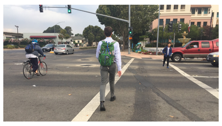
Pedestrians and bicyclists crossing Davis Street along San Leandro Boulevard.