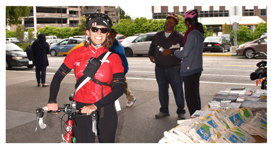
A happy cyclist on Bike to Work Day, ready to grab some freebies from the San Leandro BART Energizer Station.

Each Bike to Work Day (BTWD), the San Leandro Engineering and Transportation Department hosts a bicycle Energizer Station at the main entrance to the Downtown San Leandro BART Station. Food, drink and BTWD tote bags containing giveaways and outreach materials are provided. The San Leandro Energizer Station has experienced significant growth in participation over the years.