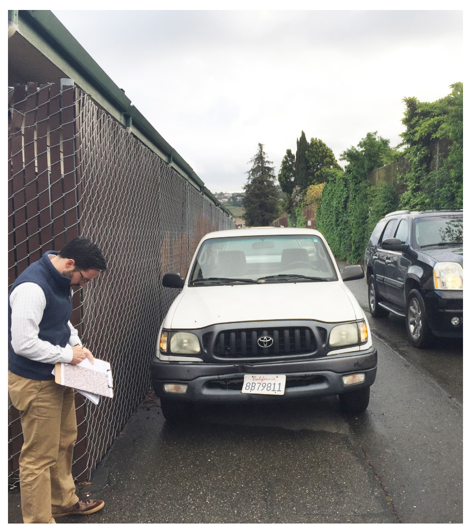
Alameda County Safe Routes to School staff observing conditions at McKinley Elementary during a school site assessment.

Education campaigns presented in the Bicycle section above, page 142, are also applicable to pedestrian safety initiatives.