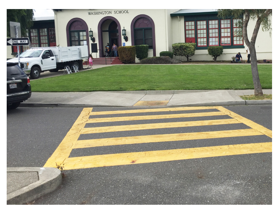
A crossing over a free right turn lane in front of Washington Elementary.

The effectiveness of SR2S programs and projects in San Leandro could be enhanced if future SR2S grants and projects were coordinated to achieve a strategic vision. Thus, it is recommended that San Leandro develop a Safe Routes to School Strategic Plan with measurable goals and milestones. Guidance for this Strategic Plan could come from a Safe Routes to School Steering Committee, which could be composed of City and school district staff, parents, nonprofit organizations such as Cycles of Change, Bike East Bay, and other related stakeholders. This plan should also be coordinated with the larger countywide efforts of the Alameda County Transportation Commission.