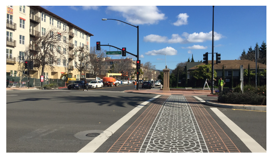
Recently improved pedestrian facilities at W Juana and San Leandro Boulevard