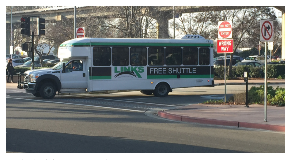
A Links Shuttle leaving San Leandro BART.

The following pages display maps of the recommended bikeway network improvements, focused around San Leandro's two BART Stations.