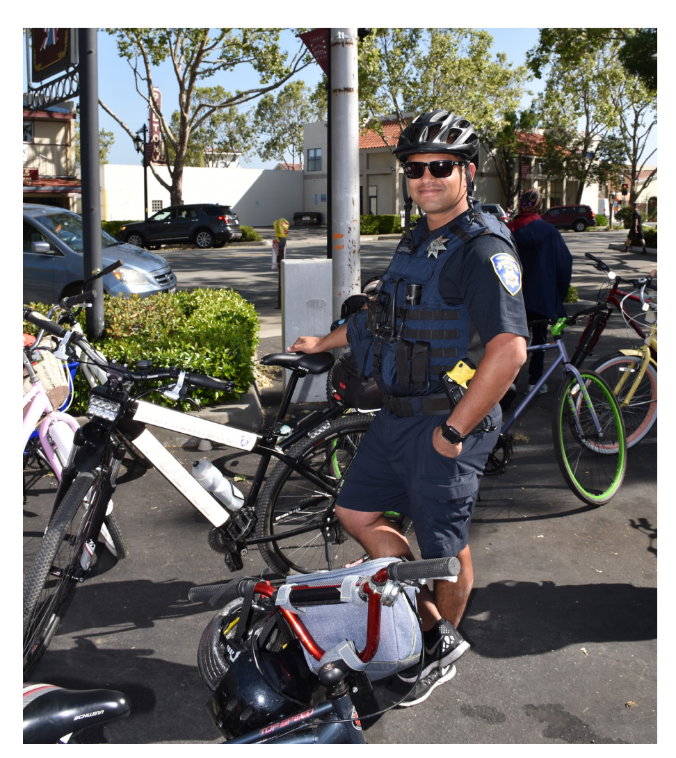
A San Leandro Police Department bicycle officer.

Figure 23 displays bicycle collision locations with injury severity throughout the City of San Leandro.