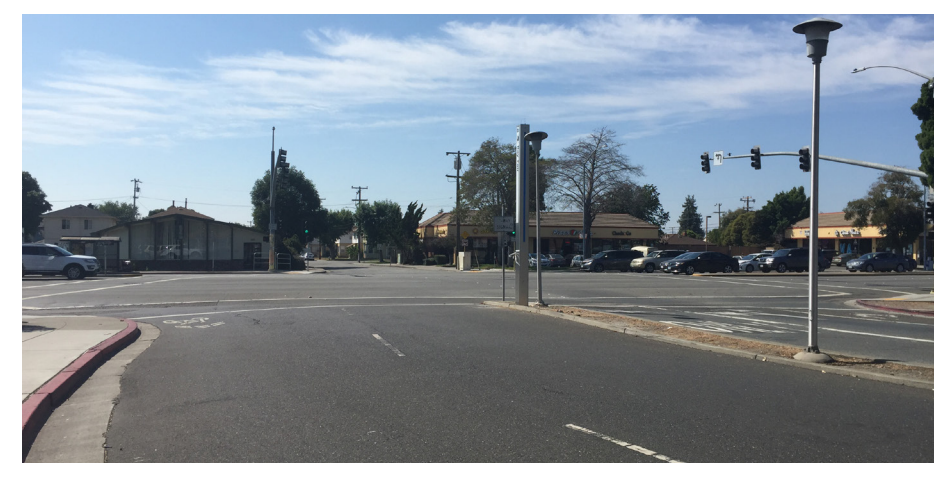
The intersection of Hesperian Boulevard and Thornally Drive.