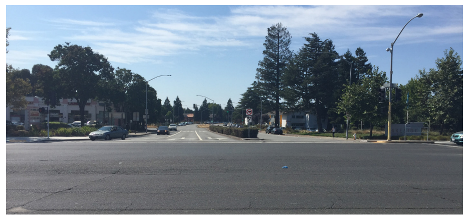
Hesperian Boulevard and Springlake Drive is a wide T-intersection.