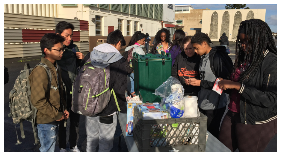
San Leandro High students lining up for some hot chocolate during Cocoa for Carpools.

Tools such as school site assessments, help identify and address physical barriers. Safe Routes to School efforts can also help advocate for enhanced bicycle and pedestrian facilities near schools and can help coordinate tactical urbanism events that correspond with major events like Walk and Roll to School Day or Bike to School Day.