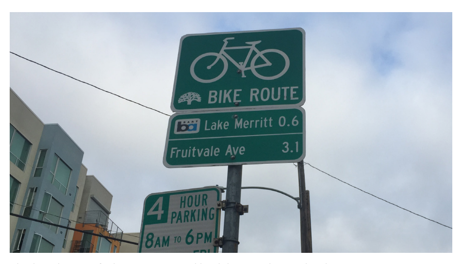
This bicycling wayfinding sign from Oakland directs riders to the closest BART Station.