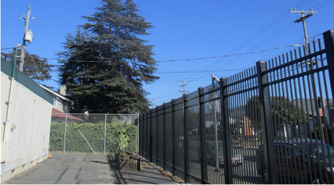
Right side of photo shows existing school fencing on Dutton Ave.