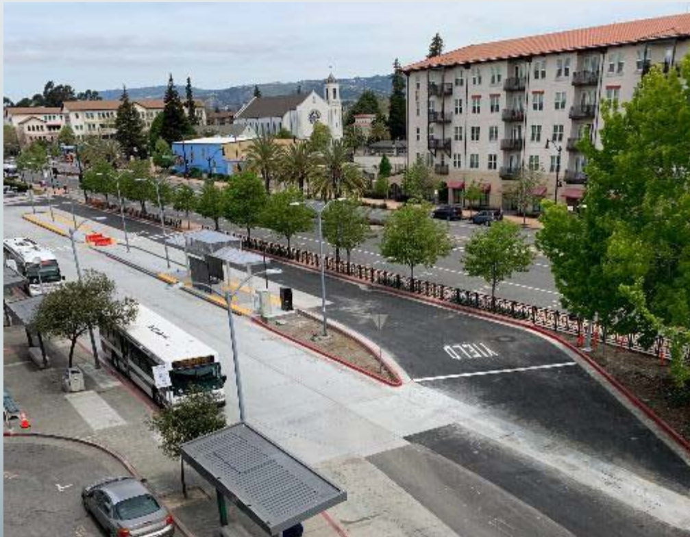
South to North from the BART Platform